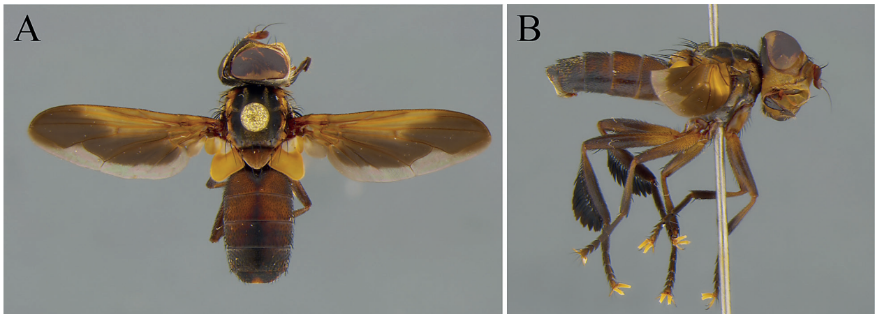
Fig. 1: Trichopoda ( Galactomyia ) pictipennis , ♂ (France, Lot-et-Garonne). A. Dorsal habitus. B. Lateral habitus. Body length 9 mm.

of KAZILAS et al. (2020). Only the species records by ZIEGLER & STANDFUSS (2020) are not published as Trichopoda pennipes , but as an unknown species similar to T. giacomellii sensu SANDS & COOMBS (1999) – a misinterpretation of T. pictipennis . The real T. giacomellii (BLANCHARD, 1966) is now a synonym of T. pennipes . Also examining photos from online sources (Academy & National Geographic 2021), we can observe only specimens of T. pictipennis (photos of the black colored female, and the males more brownish to yellow colored, with large yellow markings on the wing).