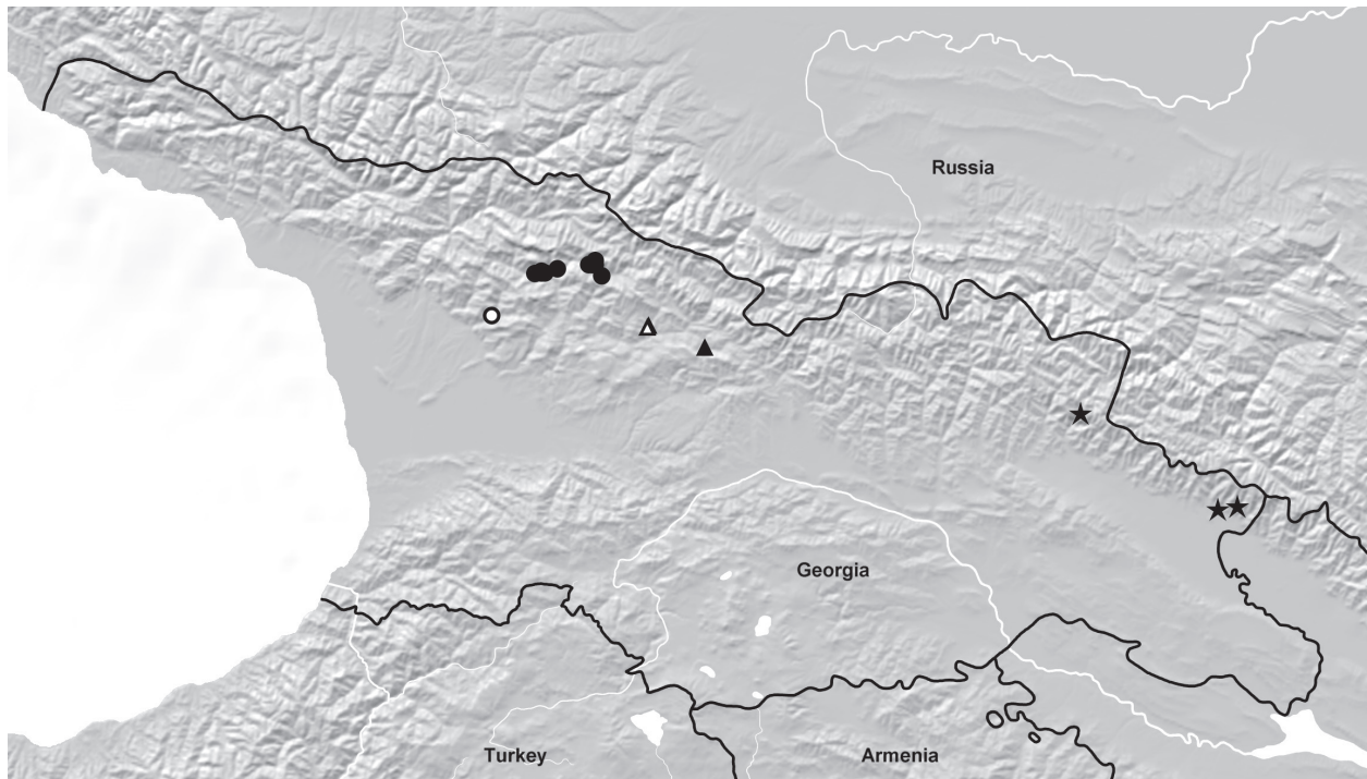
Map 1: Distributions of Geostiba egrisca (white circle), G. recta (filled circles), G. artistifula (white triangles), G. brevifistula (black triangle), and G. kakhetiana (black stars).

Distribution and natural history: The type locality is situated in the southern slopes of the Egrisi Range, in the valley of Tekhuri river, some 25 km to the north of Martvili, Zemo Svaneti (Map 1). The specimens were sifted from leaf litter at the margin of a moist mixed deciduous forest at an altitude of 540–580 m.