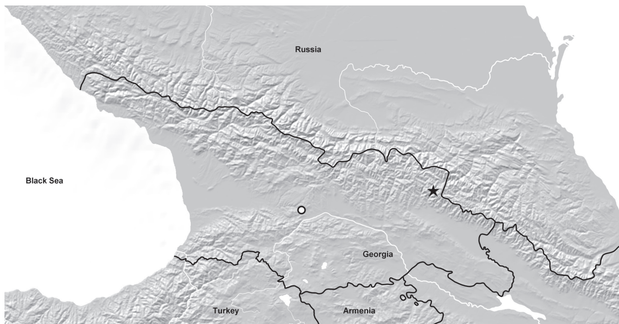
Map 1: Distributions of Tectusa species in the Caucasus region: Tectusa abanona (black star); " T. " caucasica (white circle).

posterior margin of tergite VII without palisade fringe; tergite VIII with broadly convex posterior margin.