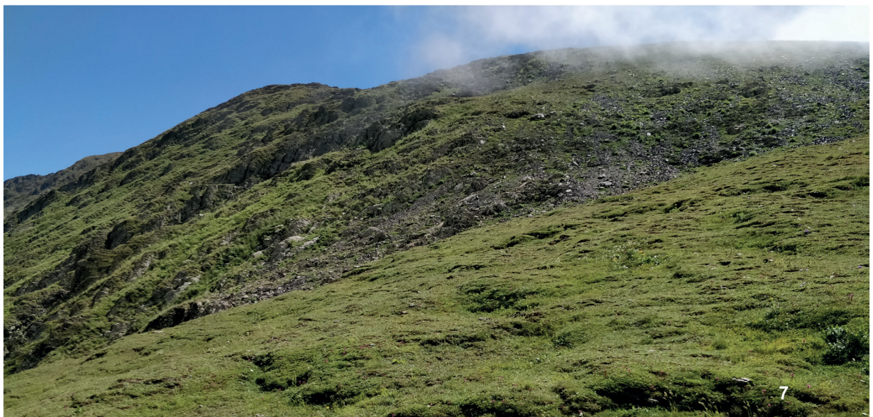
Figs 1–7: Tectusa abanona : 1 – habitus; 2 – forebody; 3 – antenna; 4–5 – median lobe of aedeagus in lateral and in ventral view; 6 – paramere; 7 – type locality (Georgia: Kakheti: Abano pass, 42°16'42"N, 45°30'32"E, 2860 m). Scale bars: 1: 1.0 mm; 2: 0.5 mm; 3, 6: 0.2 mm; 4–5: 0.1 mm.