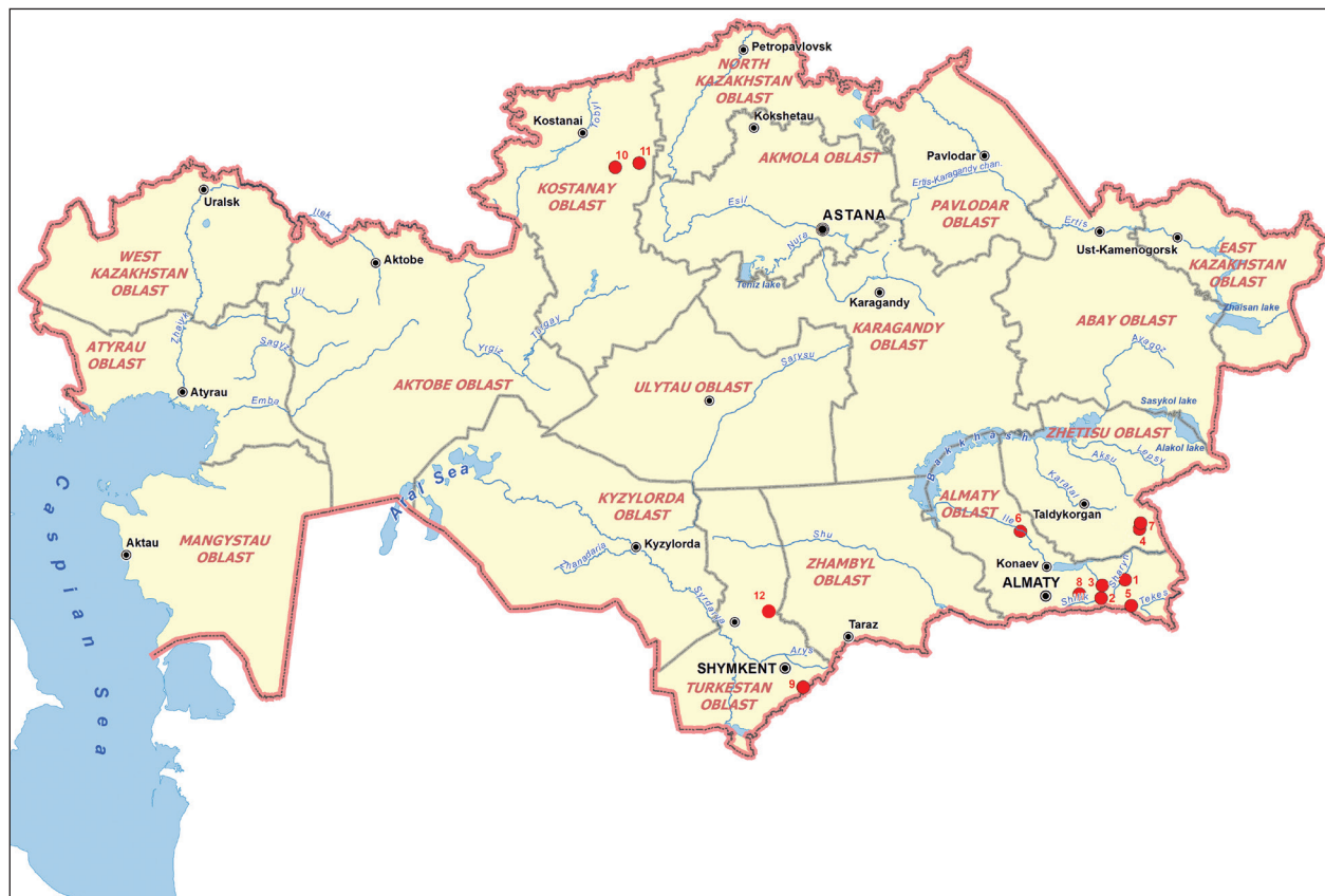
Figure 1. Sample localities in Kazakhstan.

Locality 5. Southeast Kazakhstan, Karkara River, 42°49.235'N, 79°12.758'E, 1967 m a.s.l., 06.vi.2023, leg. A. Linnik. The mountain river at the sampling site flows through a wide valley, actively used for grazing livestock (Fig. 2E).