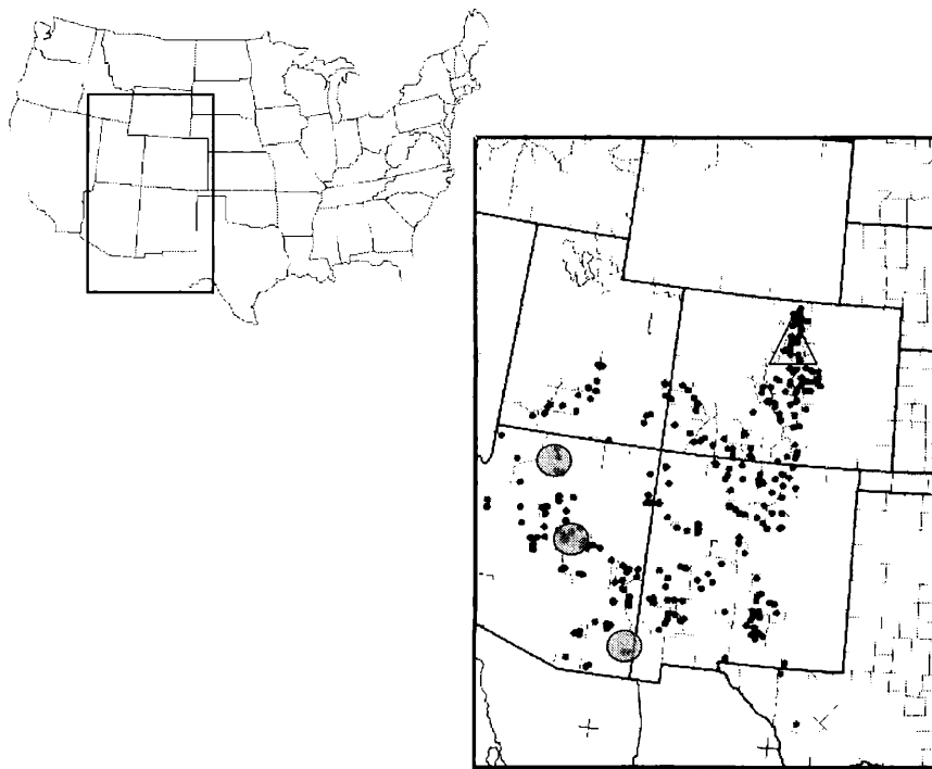
Fig. 1: Field sites in Arizona (large grey circles) and Laporte, Colorado (grey triangle) superimposed on a distribution map of the host mistletoe Arceuthobium vaginatum subsp. cryptopodum (small black circles). The Arizona sites, from north to south, are Jacob Lake, San Francisco Peaks and Rustler Park.

In July 2003 I carried out field investigations at three localities in Arizona (Rustler Park, San Francisco Peaks, Jacob Lake) and one in Colorado (Laporte) (Fig. 1). The goal was to verify the presence of C. distincta on Arceuthobium mistletoes, determine the nature and frequency of C. distincta color forms, and elucidate relationships among the spittlebugs, the mistletoes, and the ultimate conifer hosts. The Arizona sites were chosen based on published information or specimen labels indicating that C. distincta could be found at those localities. The Colorado site was chosen as an accessible area well out of the summer monsoon range that had abundant P. ponderosa heavily infested with A. vaginatum subsp. cryptopodum . During 2003 and 2004 I also examined C. distincta specimens in four entomological collections: the Snow Entomological Collection of the University of Kansas Natural History Museum (Lawrence, Kansas), the American Museum of Natural History Southwestern Research Station (near Portal, Arizona), the U.S. National Museum (Washington, DC), and the Natural History Museum (London, UK).