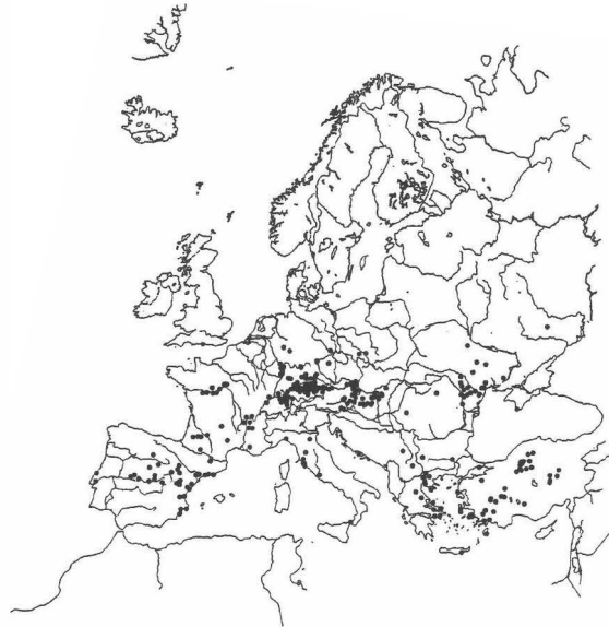
Fig. 1: Geographic distribution of localities used in the analyses presented herein. Some localities East of Turkey and the Black Sea are not shown in this figure (from ALROY et al. 1998).

A multivariate method (disjunct distribution ordination, DDO) was applied to a large number of Miocene to Pleistocene localities with mammal faunas from Western Eurasia (Fig. 1). Information was taken at the species level.