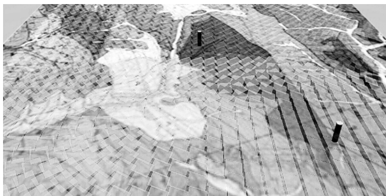
Fig. 3. Spatial distribution of fractures in Nowa Ruda serpentinite massif (SW Poland) – view 2.

set of surfaces with the same dimensions, can represent fluid flow pathways. When one know the relation between the isotope composition of mineral in the vein and in the rock, some attempts can be made to find spatial distribution of water-to-rock ratio.