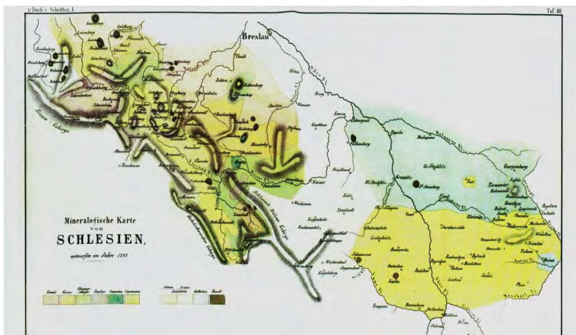
Fig. 3: Leopold von BUCH. / 1802. Mineralogic map of Silesia, designed in 1797. / Mineralogische Karte von Schlesien, entworfen im Jahre 1797.