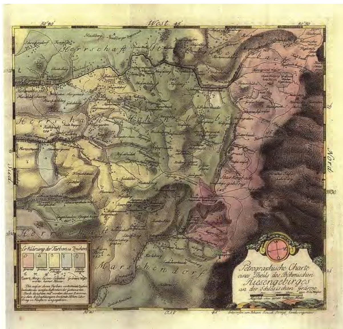
Fig. 1: Johann JIRASEK (1791) / Petrographic map of a part of the Bohemia Giant Mountains at the Silesian border. / Petrographische Charte eines Theils des Böhmisches Riesengebirges an der Schlesischen Gränze.

The set of geological maps collected within the completed international project "Visegrad Fund" includes maps that were compiled in the late 18 th and early 19 th centuries (CEJCHANOVA et al., 2011)