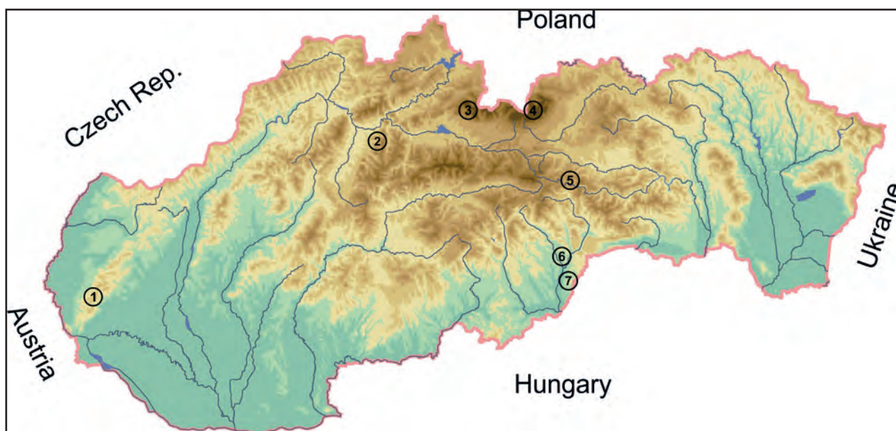
Fig. 1: Location of Slovak cave bear sites mentioned in the text.

The stratigraphically earliest fossil record of cave bears in the Slovak territory of the Western Carpathians is probably reported from Trojuholník Cave in the Borinka Karst (Malé Karpaty Mts.) near Bratislava capital city. Although fossil remains were attributed to cave bears probably from the Middle Pleniglacial (SABOL, 2005), these show also several primitive characters in dentition, with the predominance of rather simpler morphotypes in premolars (A, A/D, B in P4s and C1 and C3 in p4s). Also smaller dimensions of teeth, comparable rather with those of Ursus deningeri , and some taphonomic phenomena, such as a skull deformed by overlying sediments, indicating a longer sedimentary history, can point out a different taxonomic position of these cave bear fossils ( U. spelaeus ssp.) than in cases of finds from other Slovak sites ( U. ingressus ).