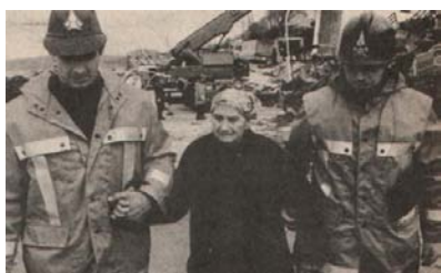
Fig. 1: 1982 event.

An intense landslide affected the northern area of the city, the "Montagnolo" hill started to slide towards the sea. The event involved about 180 m 3 during the movement.