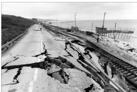
Fig. 2: The National Railway MI-LE (Adriatica) and regional Highway Flaminia.

In the morning of 13 th December, after a night of uninterrupted movements and noises due to the opening fractures of buildings, the residential districts named "Posatora" and "Borghetto", were evacuated (Figure 2).