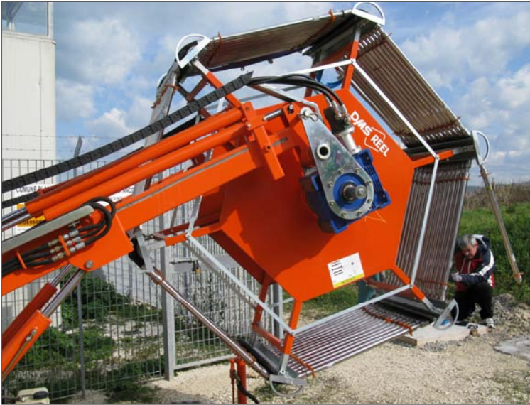
Fig. 5: DMS installation stroke.

The data from the DMS instrumentation column are sent through RS485 protocol to the control unit, which compares them with threshold values (set by the user) and stores them in a circular buffer.