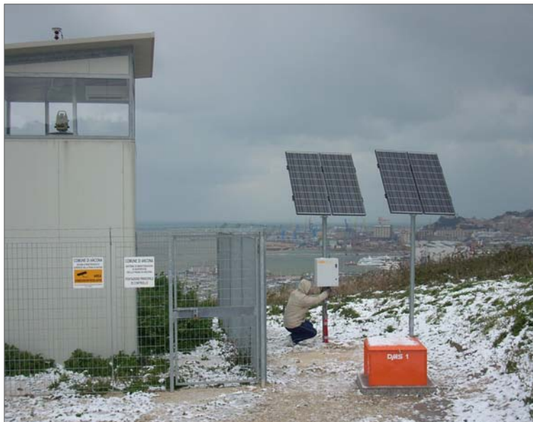
Fig. 4: Surface and geotechnical DMS-systems (Via delle Grotte site).

DMS has been preassembled in the factory and installed in place by a DMS reeler, forming an instrumented column, like a spiral cord, connecting the required number of modules, each containing one or more geotechnical-geophysical sensor and the electronic boards for data collection and transmission.