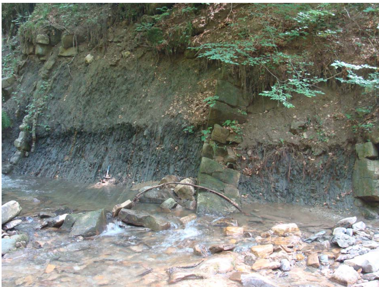
Figure A1.20 ▲ Strubach Tonstein

Interestingly, clay mineral assemblages of the Strubach Tonstein display high amounts of chlorite indicating a strong increase in bed rock erosion. In addition, the bulk rock composition of the hemipelagic shales displays an increase in the percentages of detrital quartz and feldspar of about 10%. The concurrence of indications of increased mechanical erosion in the composition of interturbidite layers and a dearth of turbidite sedimentation indicates a steepening of relief and a synchronous change of drainage patterns. Tectonic uplift and associated block faulting, which cut off the basin from the source area of turbidity currents are the most likely interpretation of the observed sedimentary features (Egger et al., 2002). This interpretation is supported by the identification of slope basins in the Ultrahelvetic nappe complex (Egger & Mohamed, 2010 – Stop A2/4). These basins were formed from the Late Maastrichtian on and acted as sediment traps, which prevented the entering of turbidity currents into the main basin.