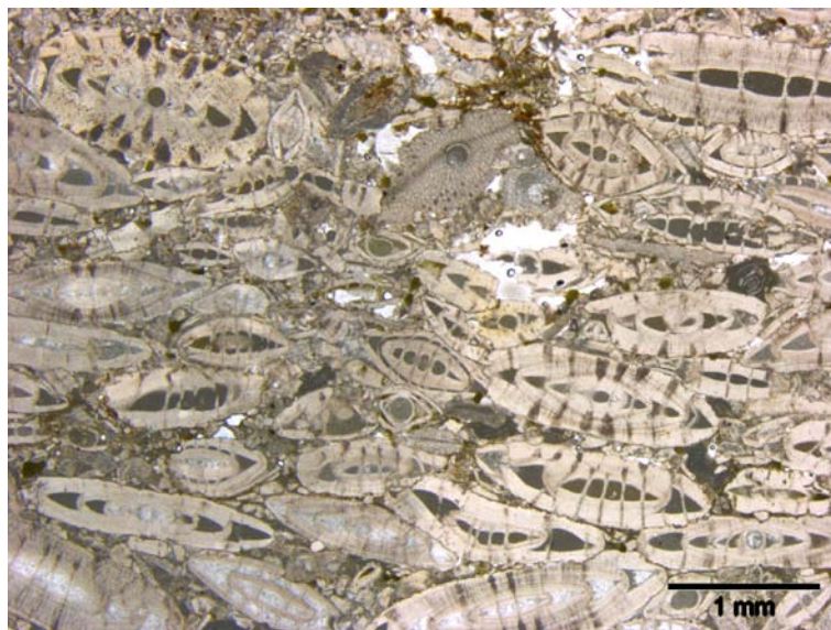
Figure A3.32 ▲

The lowermost sample (Höhwirt 1) is barren, whereas the other samples contain moderately to well preserved nannofossils. Regularly occurring nannoplankton taxa are: Campylosphaera dela (Bramlette & Sullivan, 1961) Hay & Mohler, 1967, Coccolithus formosus (Kamptner, 1963) Wise 1973, Coccolithus pelagicus (Wallich, 1877) Schiller, 1930, Coronocyclus bramlettei (Hay & Towe, 1962) Bown 2005, Pontosphaera exilis (Bramlette & Sullivan, 1961) Romein, 1979, Pontosphaera pulchra (Deflandre in Deflandre & Fert, 1954) Romein, 1979, Pontosphaera versa (Bramlette & Sullivan, 1961) Sherwood, 1974, Reticulofenestra minuta Roth, 1970, Sphenolithus editus Perch-Nielsen in Perch-Nielsen et al. 1978, Sphenolithus moriformis (Brönnimann &