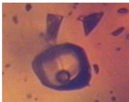
Fig. 1. L+V fluid inclusion in sphalerite (15 µm in diameter).

The Angouran Zn(Pb) ore deposit in Northwestern Iran consists of a Zn-rich sulphide ore (38 mass% Zn) and Zn-rich hypogene zinc carbonate ore (smithsonite) that formed in two successive mineralization stages. Microthermometric measurements of the primary (L+V) fluid inclusions in sphalerite (Fig. 1) yielded unusually low first melting temperatures, commonly below -59 to -66 °C (Daliran et al., 2009).