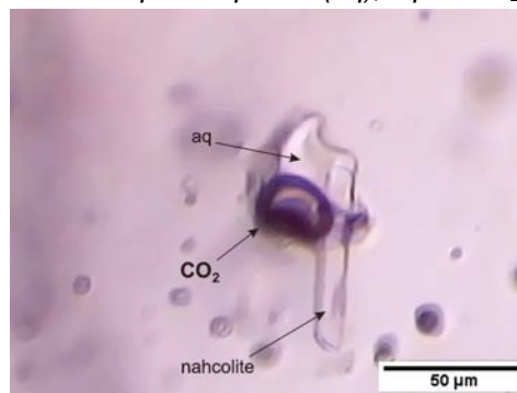
Fig. 2. Three phase fluid inclusion comprised of aqueous phase (aq), liquid \text{CO}_2 and nahcolite crystal