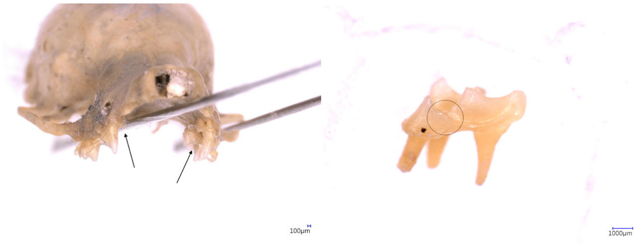
Fig. 2: On the left a frontal view on the teeth of M. alcaethoe . The Cingular cusp of the P 4 and the Paraconuli on the M 2 are clearly visible (black arrows). On the right a detailed view on the M 1 and its Paraconulus (black circle).

We show that M. alcaethoe uses or used caves in Austria similar to other locations in Europe. Since there are no summer records of M. alcaethoe within the region (Fischer 2016, Knoll et al. 2016), and we do not know the exact age of the cranium, we cannot confirm it as a current element of the local bat fauna. Mist netting at the cave entrances during autumnal swarming could reveal if M. alcaethoe is still present within the region.