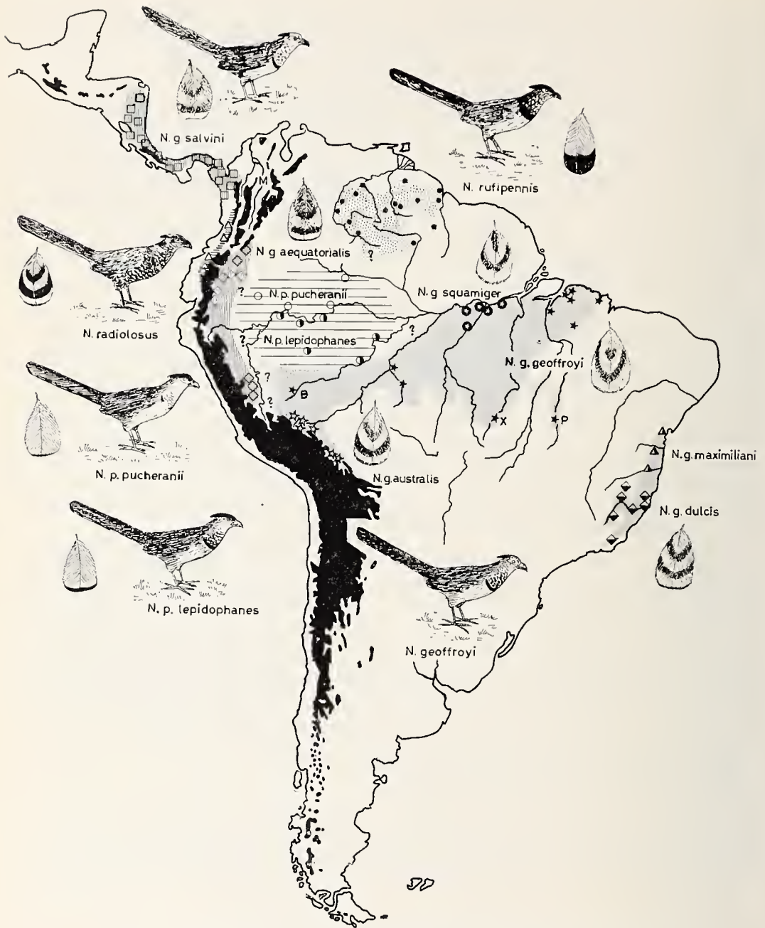
Fig. 1: Distribution of the Neomorphus geoffroyi species group.

Explanations: Neomorphus geoffroyi and N. radiolosus comprise the N. geoffroyi superspecies. Neomorphus rufipennis and N. pucheranii comprise the N. rufipennis superspecies. Symbols indicate collecting localities. Shaded areas — N. geoffroyi . Uniform gray shading — geoffroyi subspecies group: Closed stars — N. g. geoffroyi . Open stars — N. g. australis . Open stars in black circles — N. g. squamiger . Semiclosed triangles — N. g. maximiliani . Semiclosed squares — N. g. dulcis . Shaded by vertical hatching — salvini subspecies group: Open squares on edge — N. g. aequatorialis . Open squares — N. g. salvini . Area dashed horizontally and open triangles — N. radiolosus . Area stippled and closed circles — N. rufipennis . Area