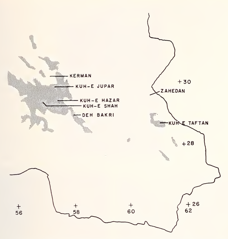
Fig. 1. Mountain ranges of southern Iran above 2000 m. Central Range on the left.

valley at the northern base of the mountains. Our camp was set at Zarda 3,000 m. This small settlement is not indicated on 1:50,000 maps but it lies 3 km south of Lalezar. The survey of the Kuh-e Taftan was made from two base camps, one in the foothills of the eastern slopes at ca. 2,100 m, the other at Kusheh 2,250 m on the western slopes. A few birds were observed or collected at lower altitudes between camps, especially near Zahedan 1,350 m. The element "Kuh" in the preceding names, meaning "mountain", will not be repeated hereafter, except in "Shah Kuh". Duration of stays: Jupar 7—13 May, Hazar 14—22 May, Deh Bakri 23—28 May, Taftan east slope 1—5 June, Kusheh 8—15 June, Shah Kuh 19—25 June, 1975. Jupar, Hazar, Deh Bakri and Shah Kuh form parts of the Central Ranges.