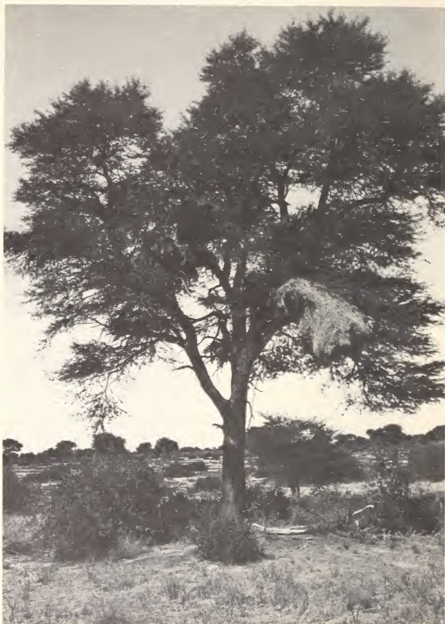
Fig. 3. Nest colonies of Philetairus socius on Acacia tree between Hukuntsi and Masetleng pan.