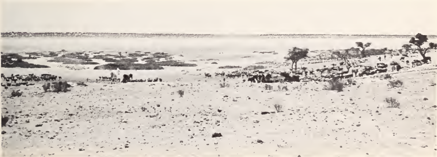
Fig. 2. Cattle and goat herds grazing at the shore of the dry Mabutsane pan.

As during the whole expedition I enjoyed the privilege of just sitting back in my seat while being driven around by my friends, I could fully concentrate on scenery and bird life and make notes, even while moving from camp to camp