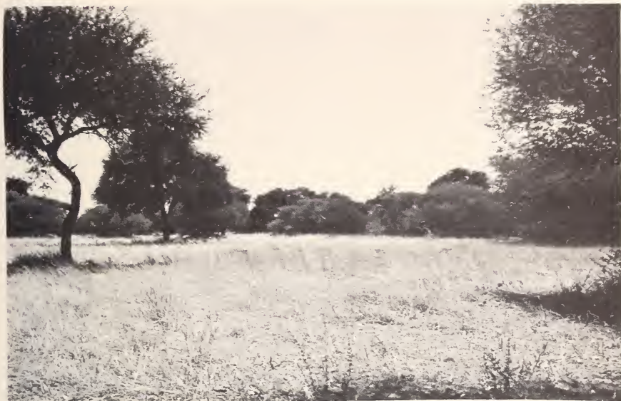
Fig. 4. Wooded savanna near the shore of the great Masetleng pan.