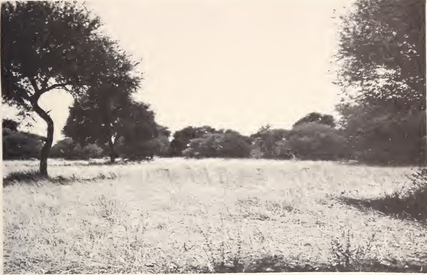
Fig. 4. Wooded savanna near the shore of the great Masetleng pan.