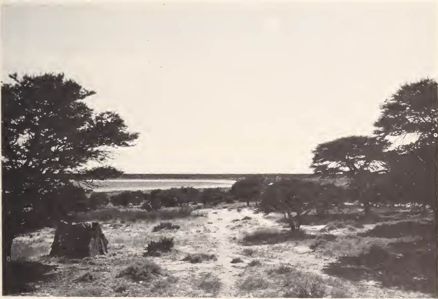
Fig. 5. Savanna bush between Tshane and Mabuasehube pan.