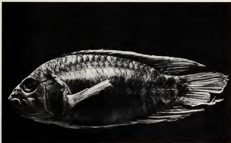
Fig. 1. Holotype of Apistogramma eunotus , an adult male, 49.9 mm standard length, from near Pucallpa, Ucayali river system.

The South American cichlid genus Apistogramma Regan, comprises a large number of small species, usually not exceeding 50 mm in body length. Thirty-eight species are currently recognized as valid (Kullander 1979, 1980 a, b), but many remain to be described. Among the fishes collected by Dr. Karl Heinz Lüling during his expedition to Peru in 1978 (see Lüling 1981,