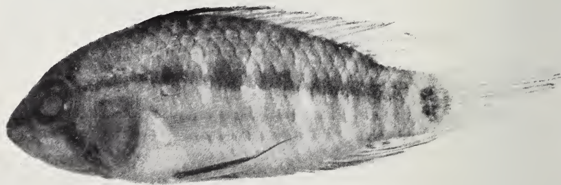
Fig. 2. Apistogramma eunotus . A young male from San Sebastian on the lower Rio Yavari, 31.7 mm standard length (NRM THO/1976311: 1164–1168).

The juvenile topoparatype is not well preserved. The ground colour is yellowish white, the markings greyish brown. The supraorbital stripe reaches to the nape and there are dark spots at the articulation of the lower jaw and immediately behind the lower lip. The vertical bars are faint; Bars 2–3 reach ventrally to the lateral band, Bars 4–7 to the ventral edge of the sides; Bars 3–5 are slightly intensified where crossing the lateral band. Four abdominal stripes of dots: (1) from above the pectoral axilla caudad into the lateral