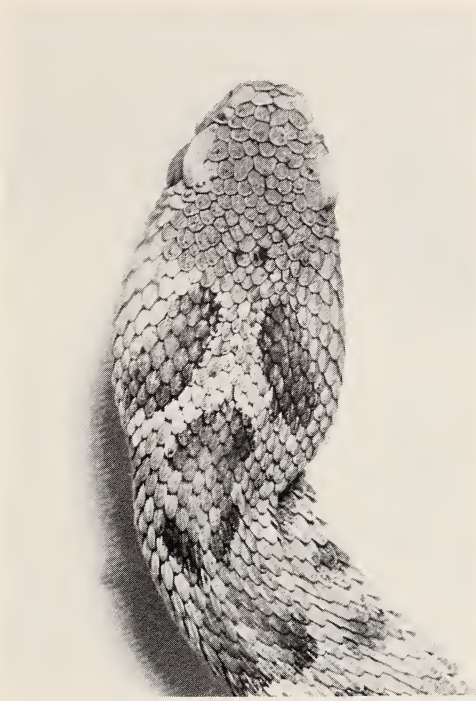
Fig. 2. Dorsal view of the head of the holotype of Vipera wagneri sp. n.

It differs from V. raddei and allied populations in Iran and from V. latifii in the absence of a complete circumocular ring, which in these taxa separates eye from supraocular, in having a single canthal on each side, in lacking erected supraocular plates, in a different pattern and in a much lower number of subcaudal plates. From V. raddei it also differs in having a lower number of ventrals.