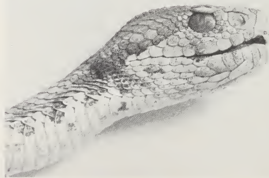
Fig. 3. Lateral view of the right side of head of the holotype of Vipera wagneri sp. n.

Discussion: The original description given by Berthold (in Wagner, 1850) states: "Schuppen gekielt in 23 Reihen. Bauchschilder 150; Schwanz-Schildpaare 23. Körper 10 Zoll, 6 Linien; Schwanz 10 Linien lang. Oben mit gelben, braun umsäumten Netzflecken; unten grau, grünlich marmorirt; hinter Auge eine schmale lange dunkle Binde, auf jeder Seite des Hinterhaupts ein schräger breiter dunkler Strich. Kopf oben rund mit kleinen gleichartigen Schuppen, aber über Augen ein Schild." The reexamination of the specimen gives equal results in most of the characteristics mentioned by Berthold, including head, body and belly pattern, size of supraoculars, number of subcaudals, number of midbody scale rows and tail length (21 mm, compared to the original value of 10 linien = 10th part of "Zoll" = 1 inch = 25 mm). However, the number of ventrals is 161 (following the Dowling method) and not 150 as originally stated. Posterior