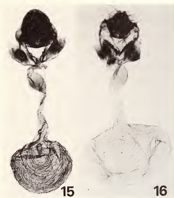
Figs. 15—16. Female genitalia of Epipsestis spp. 15. E. stueningi sp. n., paratype. 16. E. dubia (Warren), Nepal.