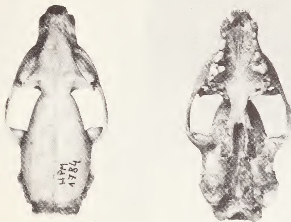
Fig. 1: Skull of Herpestes auropunctatus (adult male) from Korčula island, Yugoslavia.