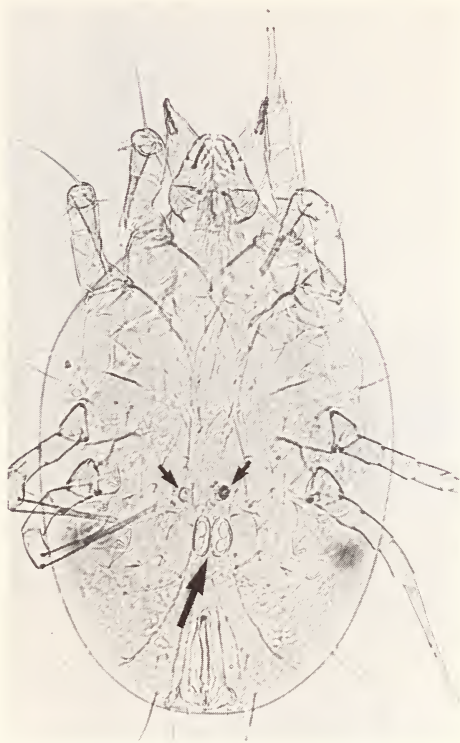
Fig. 1: Developing tritonymph within protonymph. Small arrows: genital suckers of protonymph. Large arrow: genital suckers of tritonymph.

point at the same direction. In contrast to Lukoschus et al. (1971) it was never observed in copulating pairs that a male clasps with its legs II the legs IV or III of a female. This is anatomically not possible because the male is too small for doing this. Males already mount female tritonymphs. Even during torpor and subsequent hatching they do not leave the female tritonymphs.