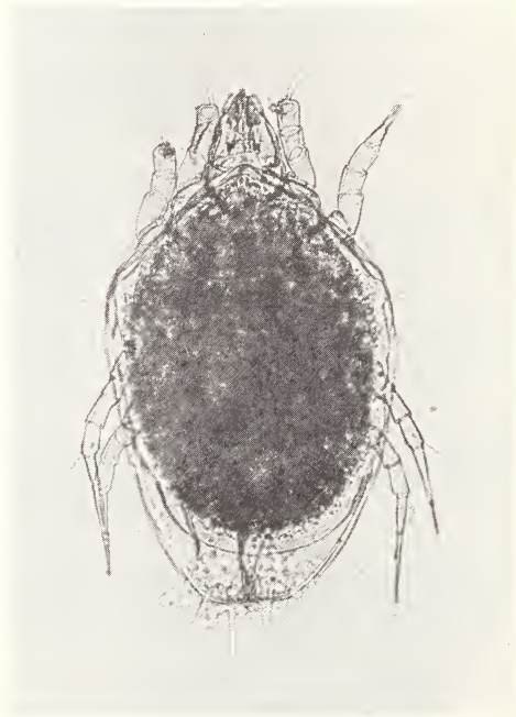
Fig. 3: Inert hypopus within protonymphal exuviae. The interior of the hypopus appears dark because of highly condensed reserve substances.