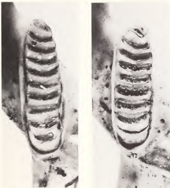
Fig. 4: Right lower molar row of O. occidentalis , holotype (left) and of O. irroratus . M_1 has five laminae in occidentalis and four in irroratus .

5. Seen from the side the skull is flattened and slightly depressed in the posterior frontal region, both in occidentalis and barbouri . In irroratus , however, it is evenly arched.