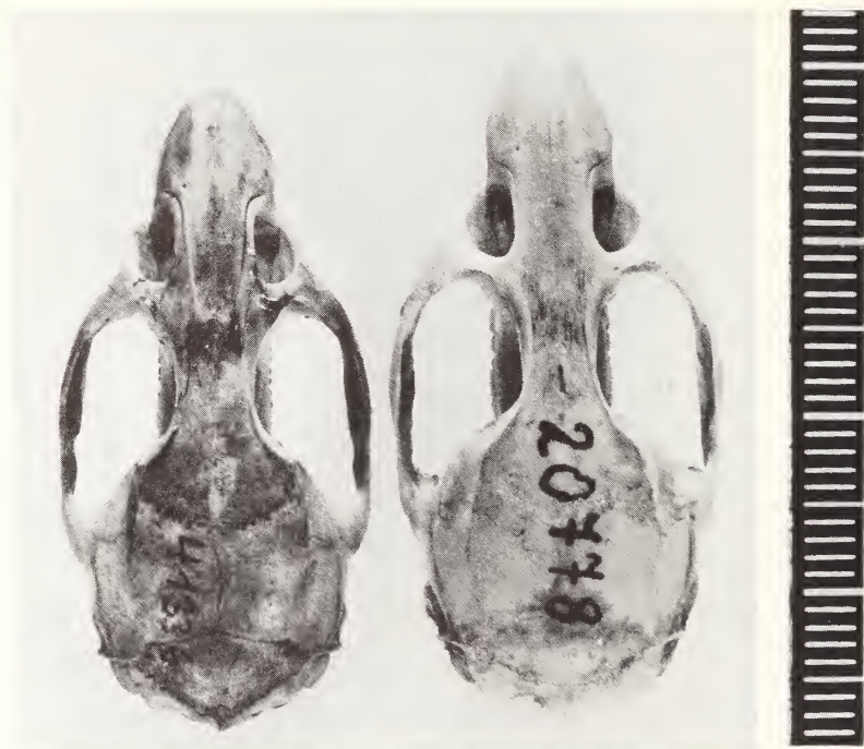
Fig. 2: O. occidentalis , holotype (left) and O. irroratus showing the different size of skulls and difference in breadth and angle of nasals.

and Nigeria the question arises whether it is closely related to O. lacustris and O. barbouri .