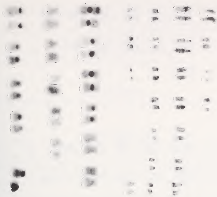
Fig. 1: C-banding. Karyotypes of a) S. strandi , female from Stavropol region, Sergievka area ( 2n = 44 , NF = 52); b) S. betulina , male from Eastern Carpathians, Goverla mountain area ( 2n = 32 , NF = 64).

At present, karyotype morphology is one of the main diagnostic characters for S. severtzovi and its similar congener S. subtilis . The karyotypes of both species also differ by the NOR localization (fig. 2a, b). In the chromosome set of S. s. nordmanni the NOR is located at the terminal parts of the short arms of the ninth (submetacentric) pair of autosomes, while in S. severtzovi these structures are in the secondary constrictions of the largest pair of acrocentrics.