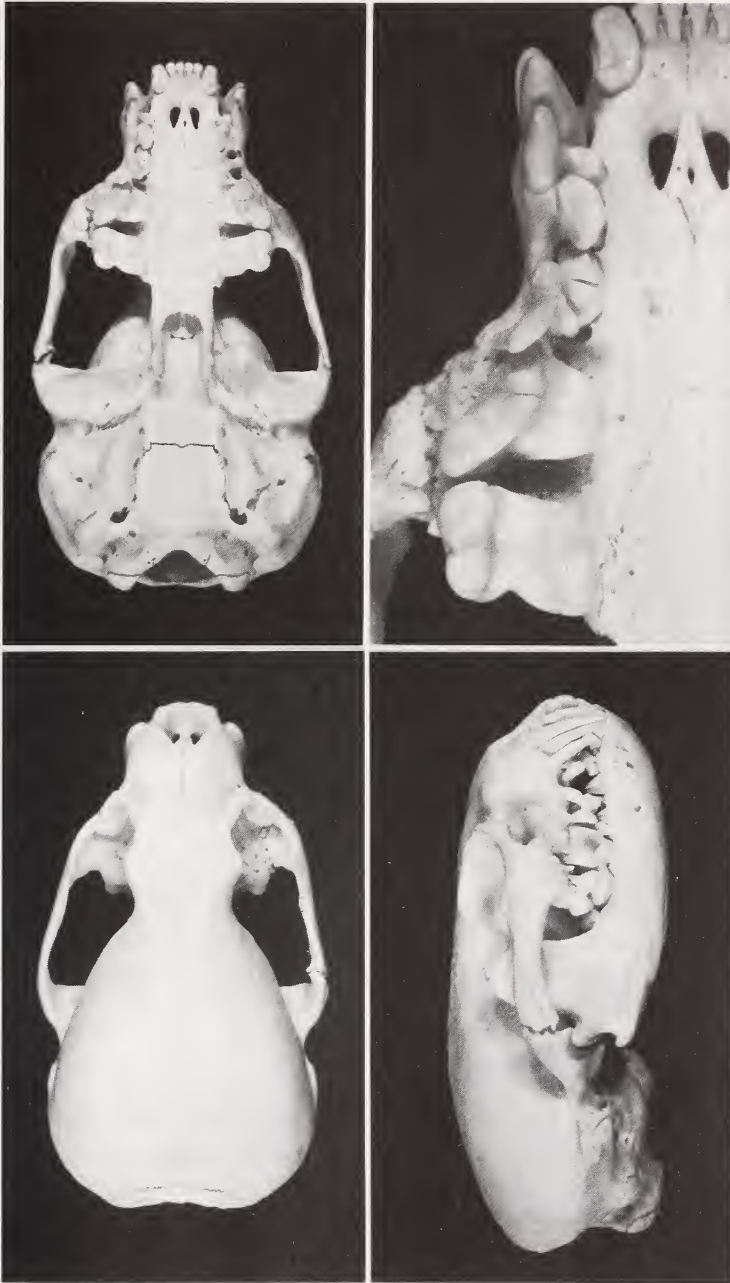
Fig. 1: Dorsal, ventral and lateral aspects including a detail of the maxillary tooththrow of a subadult Lutra lutra skull from the Panjshir-Valley near Kabul, Afghanistan. Greatest length 107 mm. Skull deposited at Museum für Naturkunde im Reiss-Museum, Mannheim, RM 36.