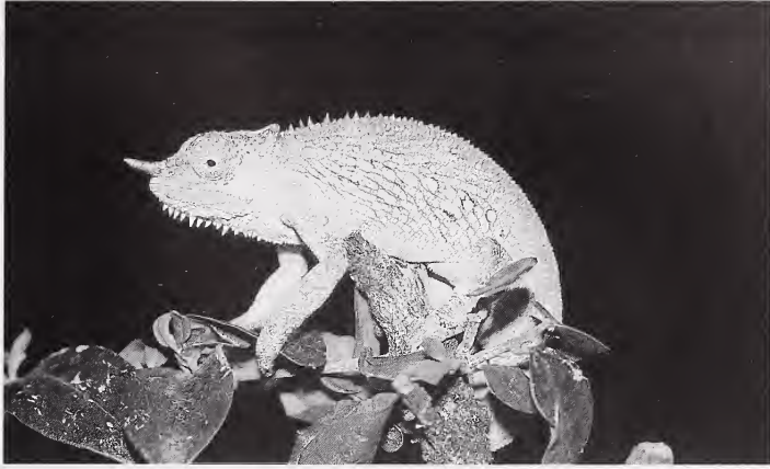
Fig. 1: Adult male of Chamaeleo (Trioceros) balebicornutus n. sp. from the Hareenna forest, Ethiopia.