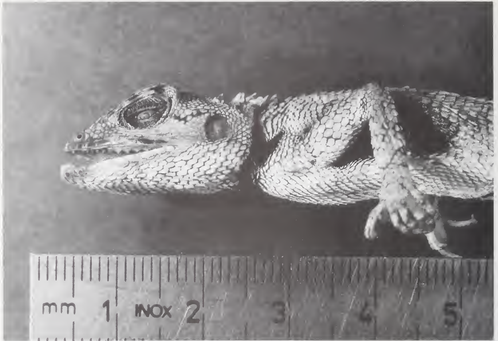
Fig. 2: Head of Calotes nigriplicatus ZFMK 26379; holotype in lateral view.