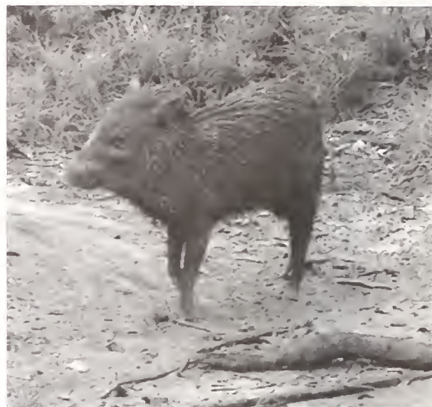
Fig. 1. Wild giant peccary Pecari maximus sp. nov. visiting a pond in the middle of continuous high rain forest; a. and b. show two different adult individuals belonging to the same family of four giant peccaries.