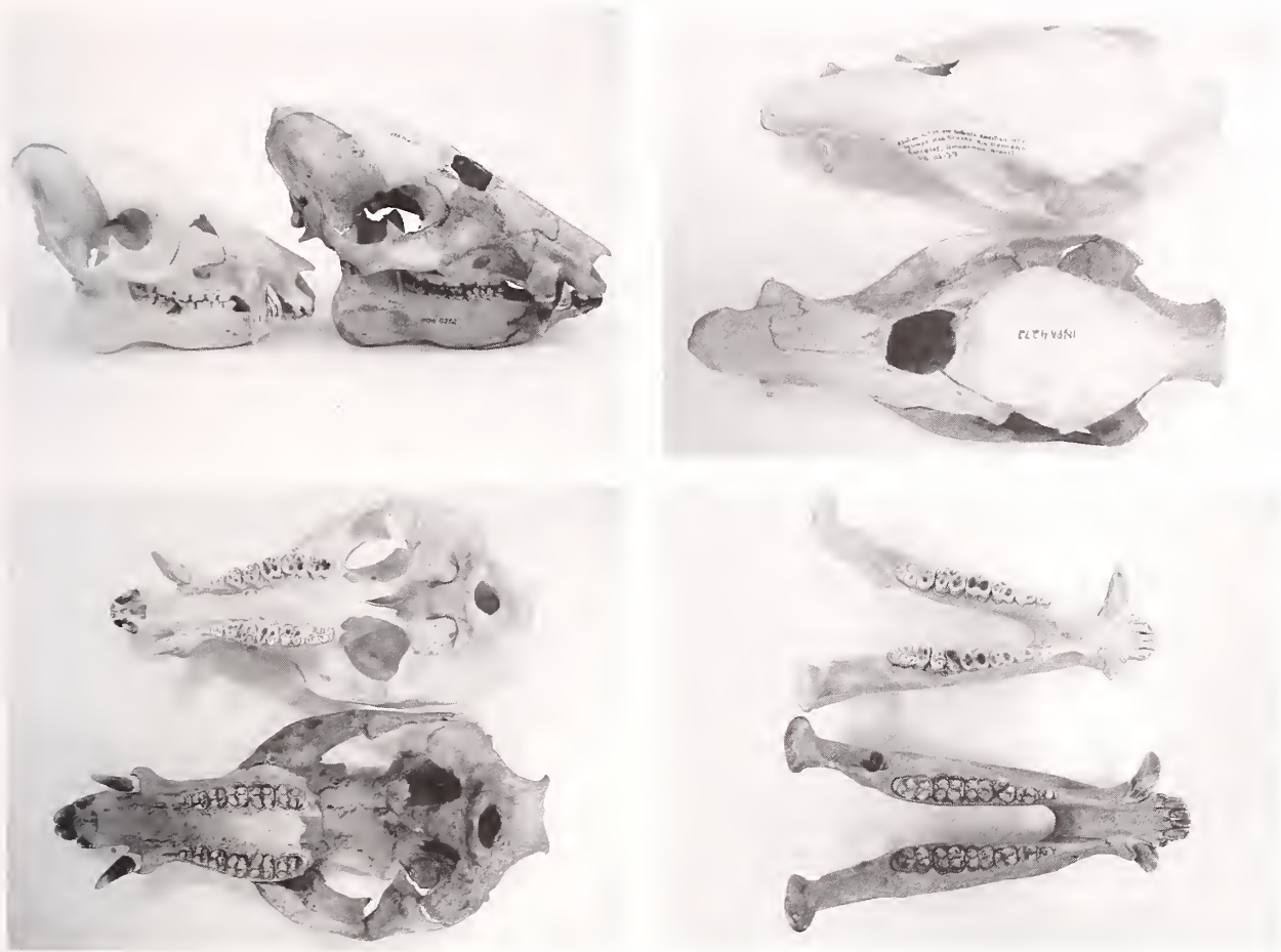
Fig. 3. a. Lateral view of the complete skulls of an adult male Pecari tajacu from Rio Demeni (INPA283) (left) and an adult male Pecari maximus from Rio Aripuanã (holotype INPA4272) (right). b. Dorsal view of the same skulls, Pecari tajacu (top), Pecari maximus (bottom). c. Ventral view of the crania of the same skulls (in same arrangement). d. Dorsal view of mandibles of the same skulls (in same arrangement).

MER & SOWLS 1993; GRUBB & GROVES 1993). Distinguished from Tayassu pecari , with which it is also sympatric, by its larger body size and weight (40–50 vs. 28 kg), and grizzled-brown thin fur instead of thick, long, evenly coloured blackish brown fur becoming grizzled or light-coloured only in the pectoral and inguinal regions. The forelimbs and legs are only distally black, while they are grizzled black and tan on the lateral and hind surfaces of the forelimbs in Tayassu pecari (GRUBB & GROVES 1993; MARCH 1993). In contrast to the general blackish brown body colour, the chin, cheeks and sides of the muzzle are white or yellowish-white in white-lipped peccaries. Distinguished from Catagonus wagneri , with which it is allopatric, by its larger body size and weight (40–50 vs. 29–38 kg), grizzled-brown thin fur with or without a faint dirty white collar instead of brownish-grey thick fur with a distinct bright white collar (WETZEL 1977; WRIGHT 1989; GRUBB & GROVES 1993).