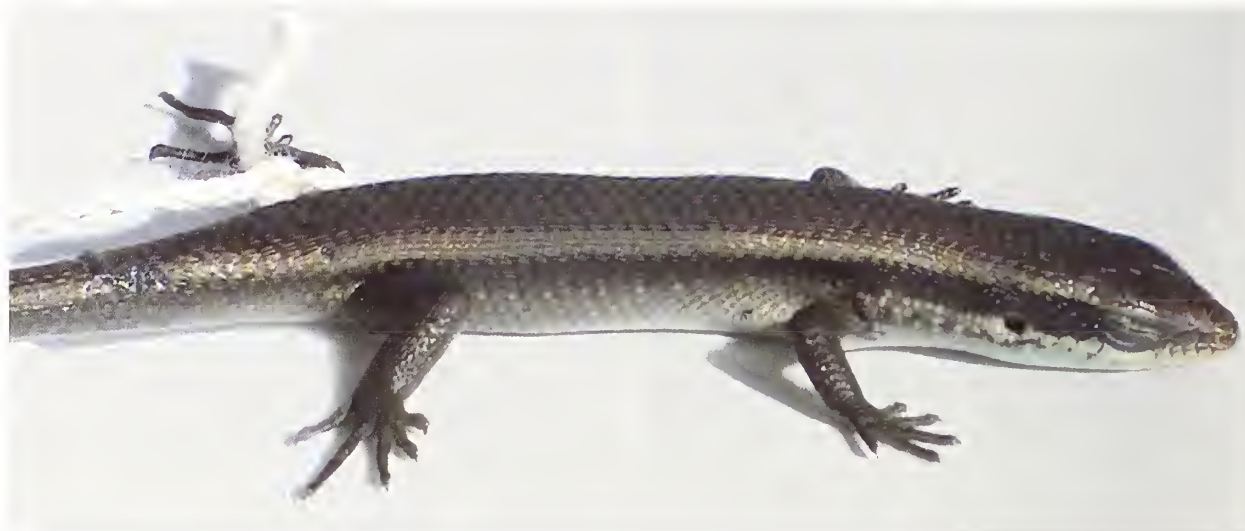
Fig. 12. Eutropis cf. rudis from Salibabu Island.

& ALCALA (1980) in having 20 and 22 keeled lamellae under fourth toe, 32 and 30 midbody scale rows (usually 28–30, rarely 31 or 32; 28–31 in E. rudis from Sulawesi according to HOWARD et al. [2007]), respectively. A post-nasal is present. The hind limbs of MZB Lac. 5142 reach the axilla as postulated by DE ROOIJ (1915), while MZB Lac. 5113 exhibits tricarinate dorsals as typical for E. rudis . The second specimen's dorsal scales have up to five keels (very rarely in E. rudis according to BROWN & ALCALA [1980]), of which the three medians are strongly pronounced and flanked by two feeble outer keels. The Talaud specimens share this character with the newly described E. grandis from Sulawesi (HOWARD et al. 2007), from which, however, they are clearly distinguishable by higher midbody scale counts (30–32 vs. 25–27 in E. grandis ). In contrast to BROWN & ALCALA (1980) and HOWARD et al. (2007) both vouchers have 40 paravertebral rows (vs. 34–38 in Philippine E. rudis and 34–35 in Sulawesian E. rudis , respectively) between parietals and base of tail. The dorsal side is brown, laterally with a dark brown streak starting behind the nostrils, bordered above by a light brown streak; ventral side light grey, supralabials also grayish. In specimen MZB Lac. 5113 the ventral side is light gray only on the first half of the body; the rest including hind limbs and tail is brownish.