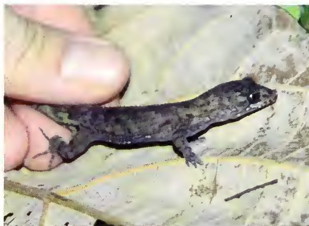
Fig. 9. Nactus cf. pelagicus from Salibabu Island.

Morphology: SVL 54 mm; tail regenerated, 55 mm long, fifth toe of left hind limb missing; probably a female, pre-anal pores missing; dorsum, limbs and tail (except for regenerated part) covered with granules and conical tuber-