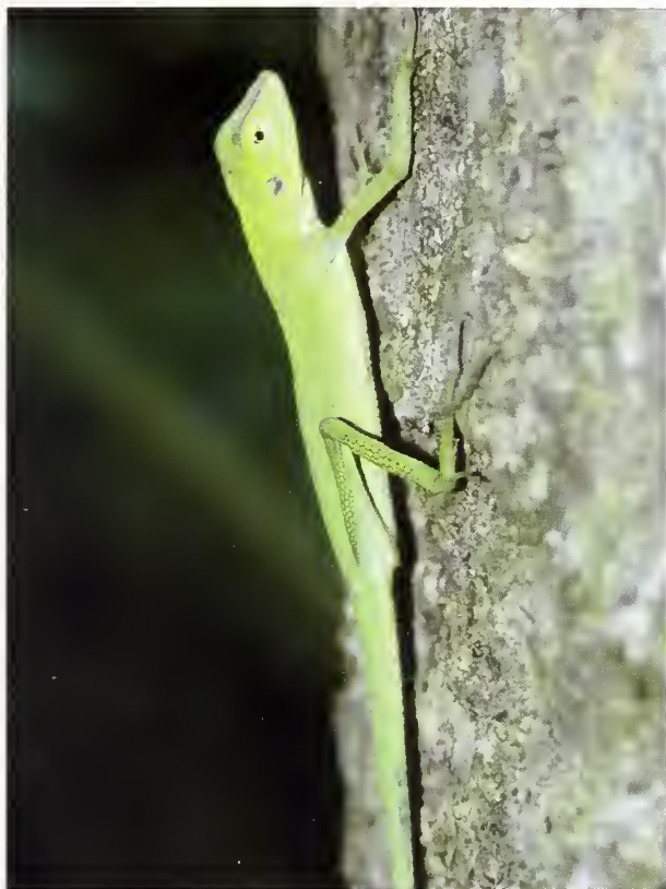
Fig. 7. Bronchocela cristatella from Salibabu Island.