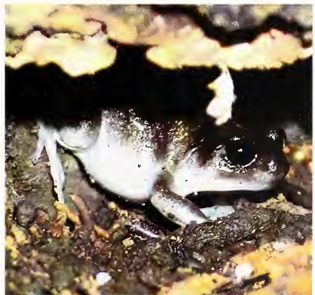
Fig. 6. Callulops cf. dubius from Salibabu Island.

Morphology & Taxonomy: Characteristically short-snouted, small frogs with short limbs: SVL 23.0–39.6 mm, TiL 9.5–15.5 mm; dorsally uniform dark brown to gray-