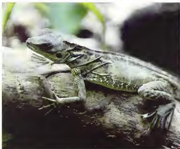
Fig. 8. Hydrosaurus sp. from Salibabu Island.

with six groups of two to six tubercular, carinate scales; three further such enlarged scales along the side of the neck; towards the ventral side numerous enlarged, smooth scales arranged in more or less distinct transverse rows; ventral scales homogenous, smooth; subdigitals under fourth toe small at basis, followed by 35 relatively enlarged subdigitals after first phalanx; toes laterally with a row of extremely wide (up to 1.9 mm) scales, 36 at fourth toe forming a serrated edge. Ten and eleven femoral pores, respectively. Ground color green to brownish with enlarged scales of the dorsal and lateral side being lighter; ventral side whitish, throat darker.