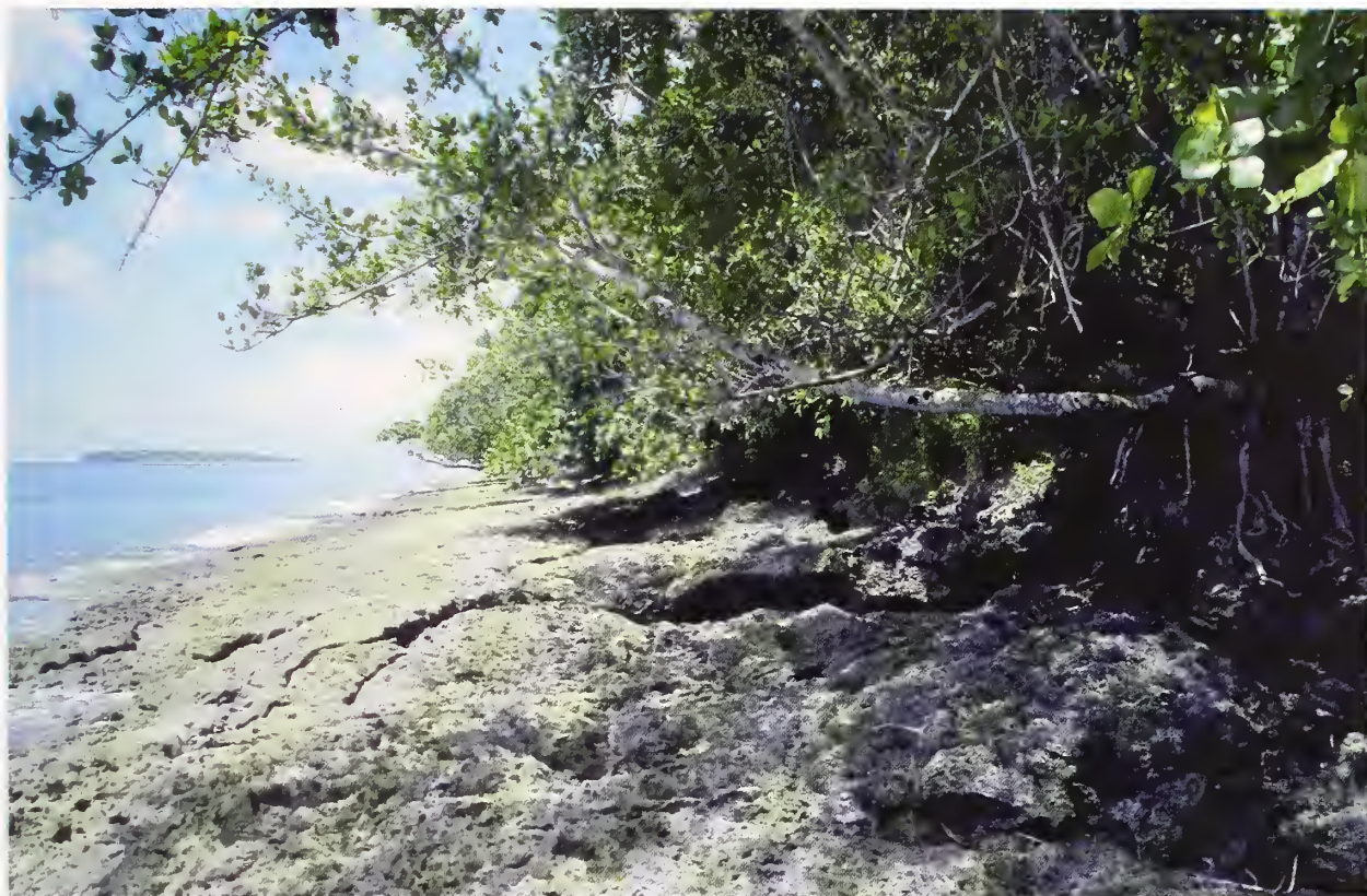
Fig. 2. Coast line with coral limestone deposits on Salibabu Island. Habitat of Varanus sp. and Emoia a. atrocostata .

The geographically isolated position between three biogeographic subregions in the centre of the Indo-Australian Archipelago render the Talaud Islands an interesting field of research for biogeographers. Until recently, however, the Talaud Archipelago (together with Sangihe) has been one of the least-known areas of the Sulawesi region as defined by VANE-WRIGHT (1991). Hence, due to their minor geographic size together with their remote location, the Talaud Island group has been paid only little attention by herpetologists in the past and scientific literature about the herpetofauna of this small archipelago is scarce. VAN KAMPEN (1907; 1923) and DE ROOIJ (1915; 1917) provided the first herpetological data about the Talaud Islands based on material collected by M. WEBER during the Siboga Expedition of 1899. DE ROOIJ (1915; 1917) listed five different lizard species ( Calotes jubatus , Varanus indicus , Lygosoma cyanurum , Lygosoma rufescens , and Mabuia multicarinata ) and one snake species ( Candoia carinata ). Later, DE JONG (1928) published the results of another small collection by the Dutch botanist H. J. LAM who visited Karakelong and Salibabu as well as Miangas, a small islet south of Mindanao, in 1926 (LAM 1926; 1942). His Talaud collection comprised ten different species representing eight lizards and two snakes. Voucher specimens by M. WEBER and H. J. LAM from the Ta-