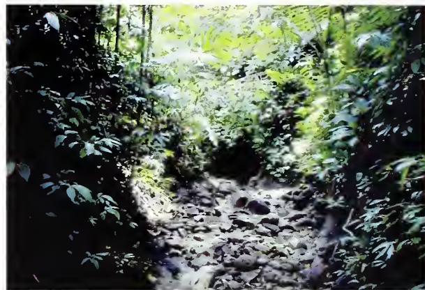
Fig. 4. Undisturbed riverine habitat upcountry of Salibabu Island. Habitat of Limnonectes sp. and an unidentified snake species.

forested. Surveys were done throughout all hours of day and early night. Specimens were mainly collected manually and with the assistance of a local villager. Voucher specimens were photographed prior to and after euthanization and preserved in 70 % ethanol. They are deposited in the Zoological Museum in Bogor (MZB). Tissue samples of monitor lizards were taken for molecular investigations and preserved in 95 % ethanol. Photographic vouchers are deposited in the private photo collections of AK and EA.