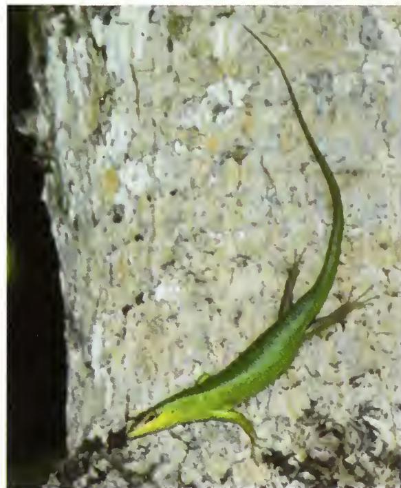
Fig. 13. Lamprolepis smaragdina ssp. from Salibabu Island.

Additional material: ZMA 11304 (1 spec.), Karakelang (= Karakelong), coll. H. J. LAM 1926; ZMA 18231 (1 spec.), Liroeng (= Lirung), Salibabu, coll. H. J. LAM 1926.