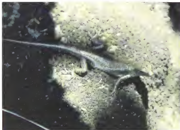
Fig. 10. Emoia a. atrocostata from Salibabu Island.

Distribution: According to BROWN (1991) the Talaud population of E. atrocostata belongs to the nominotypic subspecies. He examined one specimen from Karakelong (RMNH 18659). This coastal skink species is widespread ranging from the Philippines through the Indo-Australian Archipelago and many Pacific island groups such as the Carolines and Palau reaching North Australia. This is the first record of E. a. atrocostata for Salibabu Island.