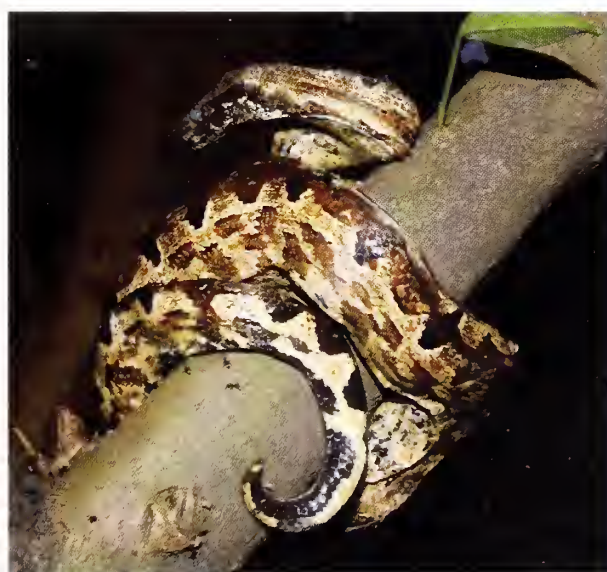
Fig. 16. Candoia paulsoni tasmai (MZB Serp. 2950) from Karakelong Island.