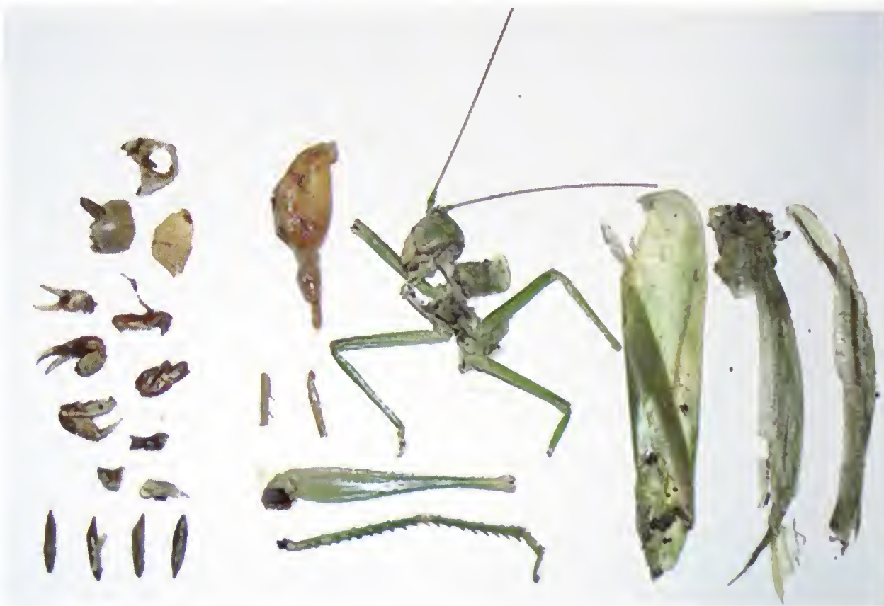
Fig. 15. Defecated prey remains from specimen MZB Lac. 5178 of Varanus sp. representing a large orthopteran ( Sexava sp., Tettigoniidae) and fragments of a crab.

tion of different age groups in the Talaud monitor lizards. While juvenile specimens seem to hide in thicket on the ground, adults obviously prefer a semi-arboreal life. The avoidance behaviour of juveniles seems reasonable because cannibalism is common in many monitor lizard species.