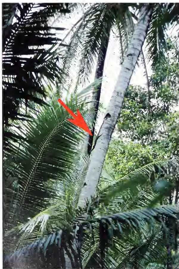
Fig. 3. Coconut and nutmeg plantations dominate the cultivated coastal landscape of Salibabu Island. Red arrow indicates Varanus sp. basking on a palm trunk.

Field studies on the east coast of Salibabu Island (ca. 95 km 2 ) were conducted by AK and EA from 13 to 21 July 2005. Collections and observations were made in the vicinity of Lirung, a settlement with a ferry landing stage. Field numbers are AK039 to AK075. The surroundings near the coastline are dominated by agricultural vegetation, especially coconut ( Cocos nucifera ) and nutmeg ( Myristica fragrans ) plantations (Fig. 3). The island's hilly interior was not intensively surveyed. In the low central hills, however, primary habitats or at least areas of minor disturbance still exist (Fig. 4). As recently recognized by RILEY (2002), and unlike the neighboring island Salibabu, large areas of Karakelong Island (ca. 970 km 2 ) are still