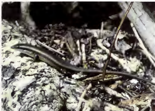
Fig. 11. Eutropis m. multicarinata from Salibabu Island.

Additional material: ZMA 18454 (1 spec.), Beo, Karakelong, coll. M. WEBER 1899.