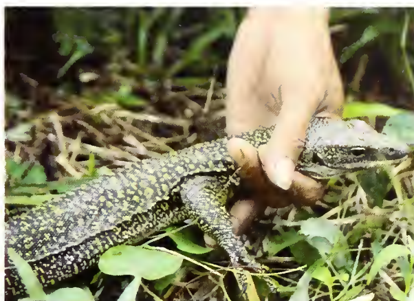
Fig. 14. Varanus sp. from Salibabu Island.

Material examined: MZB Lac. 5176 (AK067), MZB Lac. 5177 (AK064), MZB Lac. 5178 (AK059), MZB Lac. 5179 (AK066), MZB Lac. 5180 (AK065); MZB Lac. 581 (954),