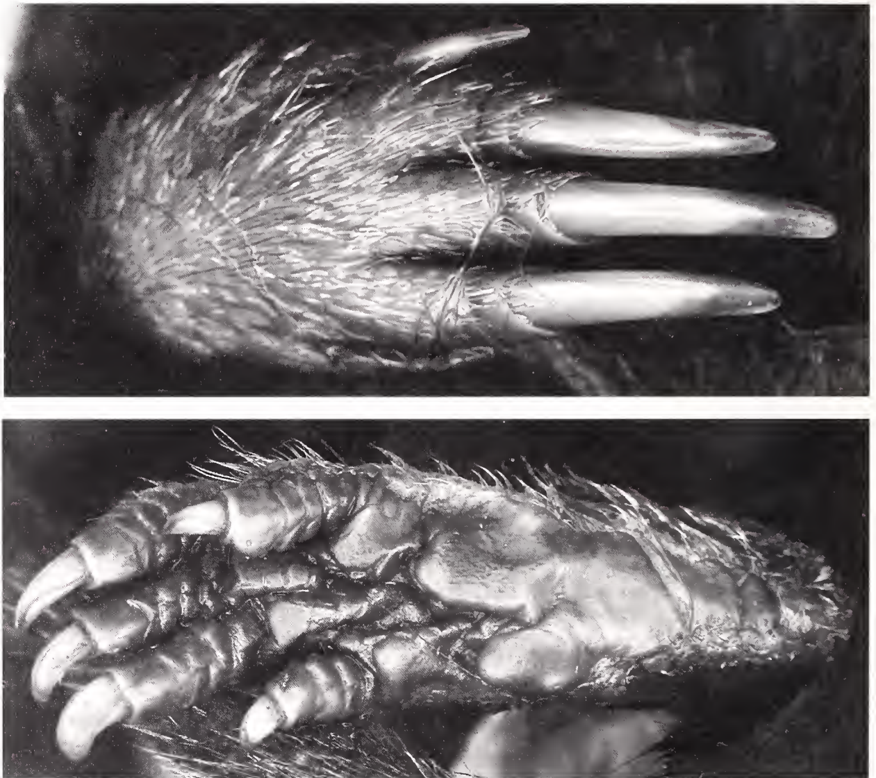
Fig. 2. Fore- and hindfoot of the holotype specimen of Surdisorex schlitteri n. sp. (FMNH 195069); length of hindfoot (including claws) is 16.1 mm.

Diagnosis. Intermediate in cranio-dental dimensions compared with the other two species in the genus, S. polulus and S. norae . Braincase smaller and absolutely shorter. The more anterior position of the pair of anterior palatal foramina is unique within the genus, as is the position of the last palatal foramen, situated between the second pair of unicuspid. Infraorbital bridge narrow. The lingual extension of the upper P^4 is longer than in the other