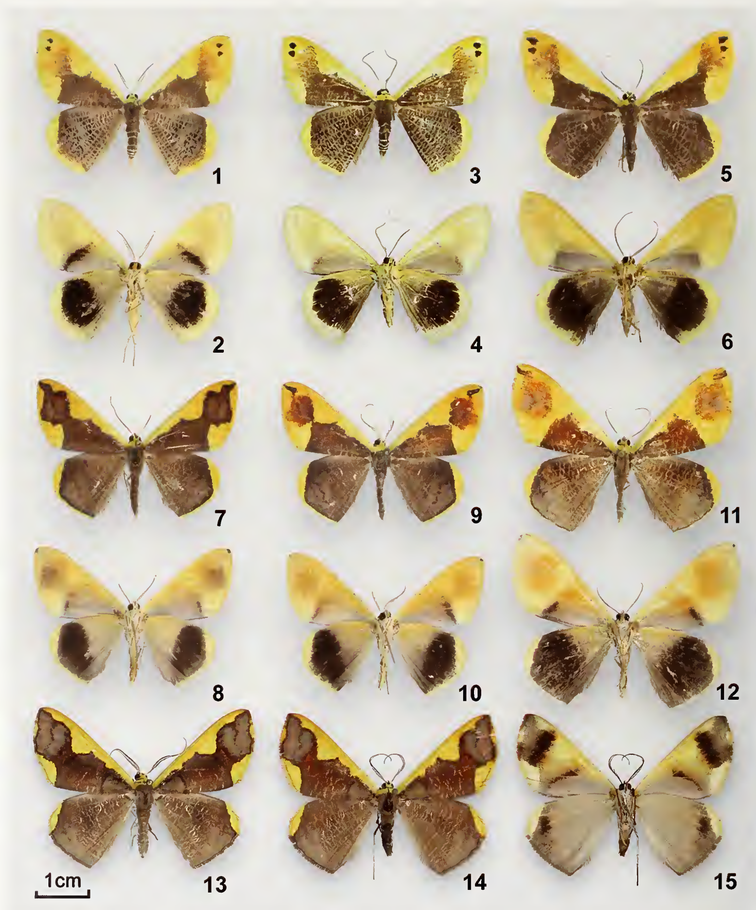
Figs 1–15. Adults of Plutodes spp. 1–4. Plutodes moultoni Prout, 1: ♂, N. Thailand, 2: underside; 3: ♂, Sumatra, 4: underside of 3; 5–6. Plutodes magdelinae sp. nov., holotype ♂, Mindanao; 5: upper side, 6: underside; 7–12. Plutodes thorbeni sp. nov., Sulawesi, 7–8: holotype ♂, 9–12: ♂ paratypes (8, 10, 12: underside); 13–15. Plutodes costatus Butler; 13: ♂, Sumatra; 14: ♀, Sumatra; 15: underside of ♀.