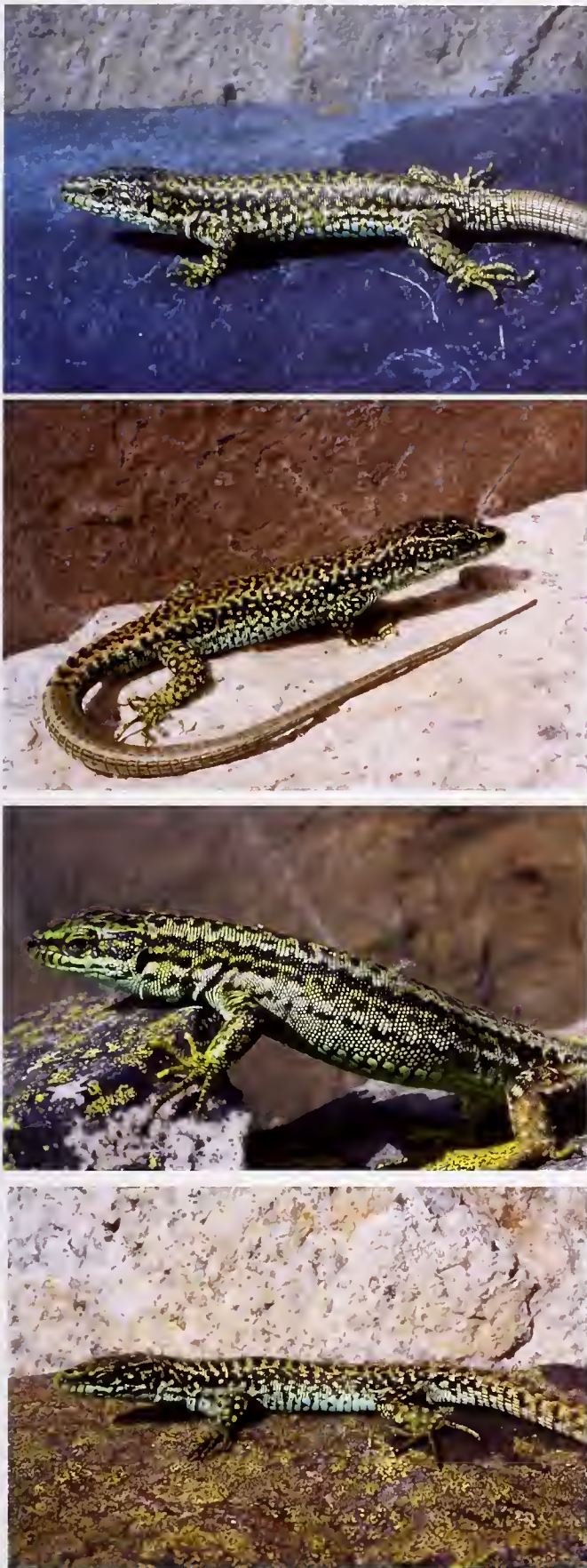
Fig. 4. Iberolacerta cyreni castiliana . a) Pico Zapatero (Sierra de la Paramera), July 2005, Male; b) Puerto de Peña Negra (Sierra de Villafranca), July 2006, Male; c) Pico Serrota (La Serrota Massif), July 2005, Female; d) Pico Serrota (La Serrota Massif), July 2006, Male.

analysis. Very significant differences ( P < 0.01 ) appear among Guadarrama and all the other samples except with Mijares. The other populations are not differentiated among them ( P > 0.01 ).