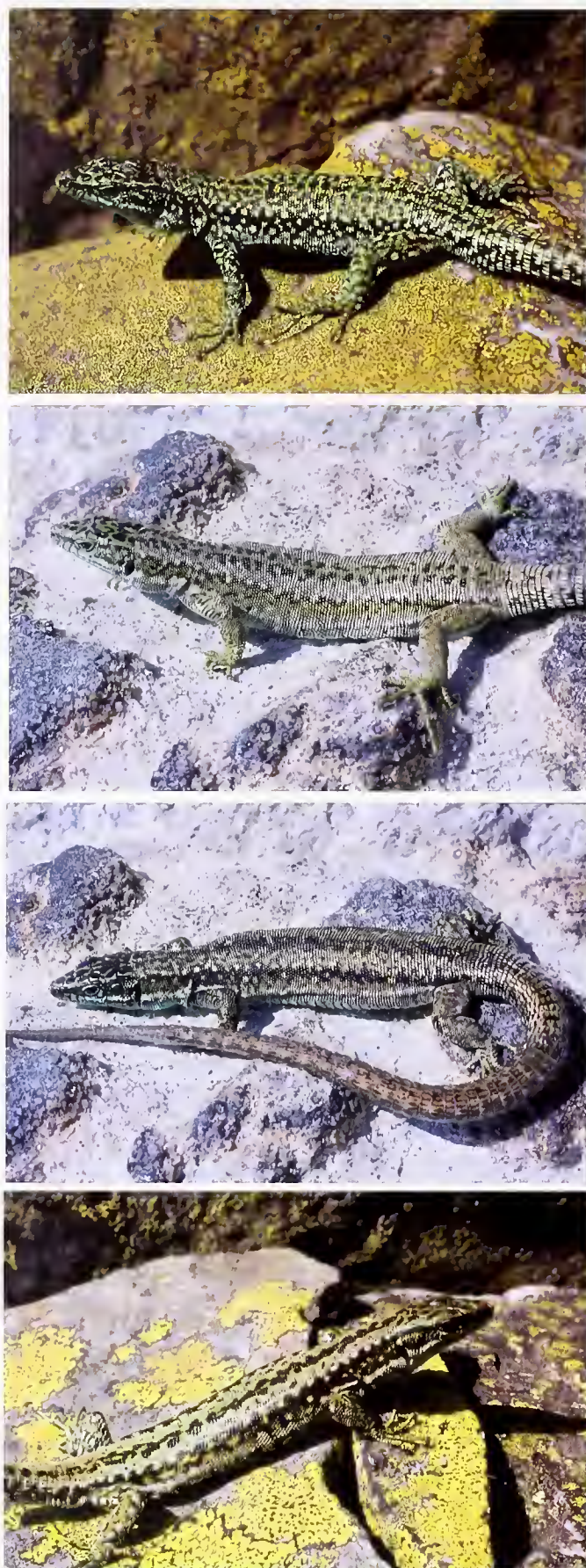
Fig. 3. Iberolacerta cyreni castiliana . a) La Covatilla Sky resort (Sierra de Béjar), July 2007, Male ; b) El Travieso (S a de Béjar), July 2004, Female ; c) El Calvitero (Sierra de Béjar), July 2004, Female (atypical pattern, with diffumination and coalescence in a unique vertebral line); d) Puerto de Mijares (Gredos Oriental Massif), July 2006, Female.

The Analysis of Variance (ANOVA) (Appendix III, Table 1) indicate that Guadarrama differs from all or nearly all the other populations in VENT and CIRCA (with the smaller and greater values for these parameters, respectively, in the former population), but also appeared differences between Guadarrama and Béjar in Dors (smaller in the former), and with Gredos in PV (greater in the former). An interesting and significant difference appears in DORS among Gredos and Béjar samples (clearly greater in the later).