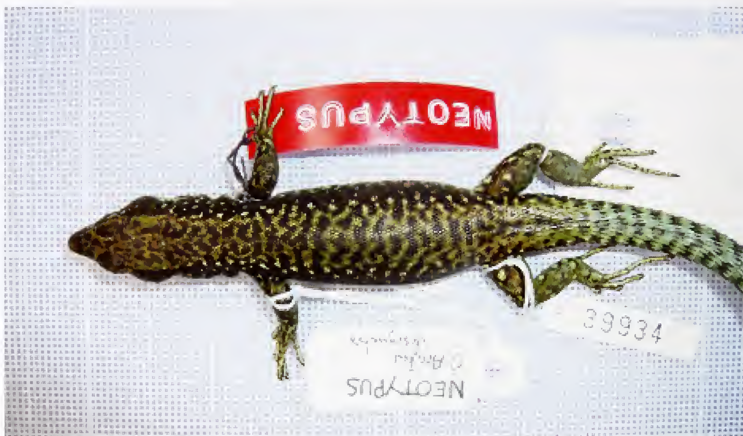
Fig. 5. Iberolacerta cyreni NEOTYPE (here designed). MNCN n. 39934.