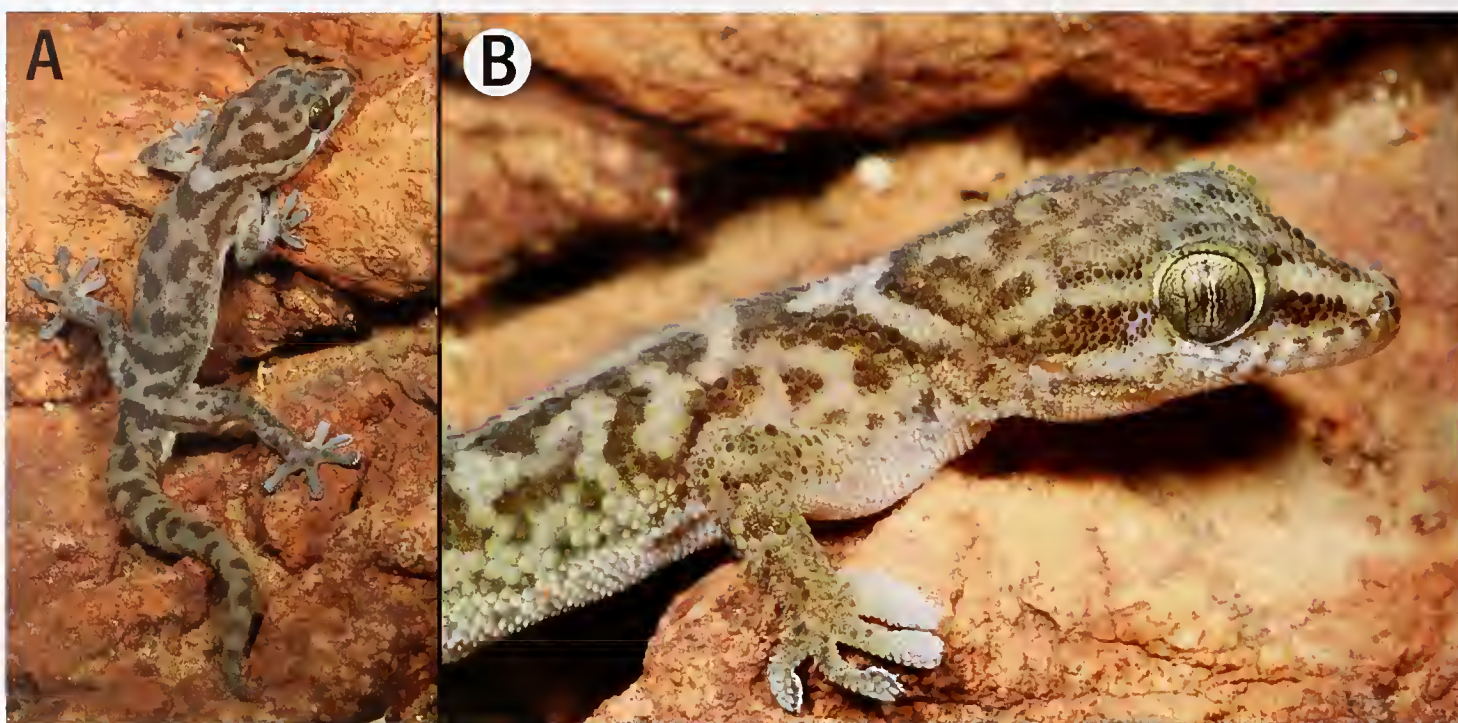
Fig. 4. Life photos of paratypes of P. boehmei sp. n. (A) MCZ R184882, male – note the raised precloacal spur visible lateral to the tail base. (B) MCZ R184880, female – note the transition from rounded, keeled dorsal tubercles to enlarged conical flank scales.

right). Color pattern variable amongst paratypes (Figs 4–5). Dark occipital and nape bands thinner in MCZ R184880, R184882 than in holotype. Dorsal oval patterns largely replaced by coalescent blotches and lines except in MCZ R184881. Dorsal pattern weakly contrasting in MCZ R184883.