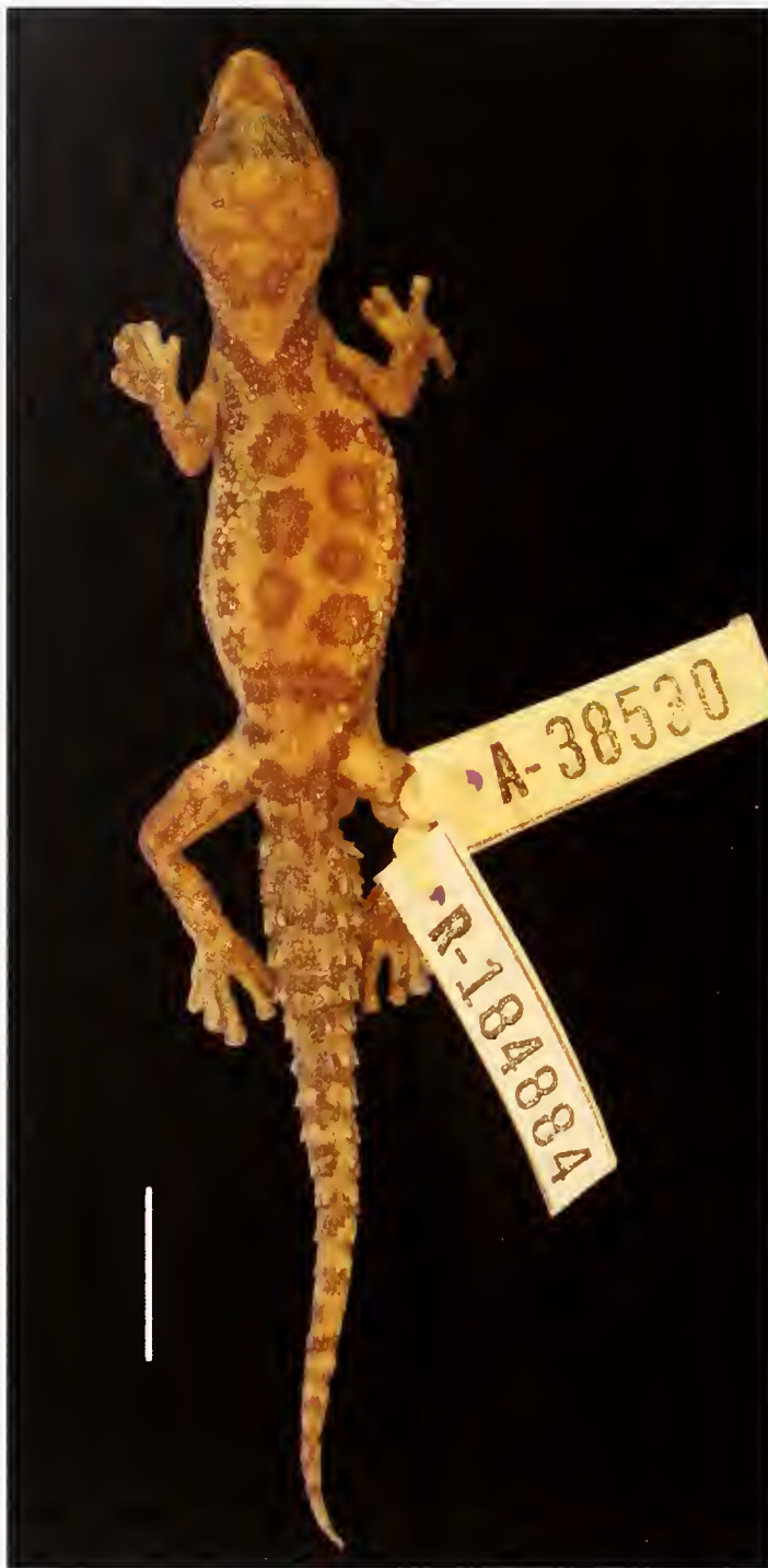
Fig. 2. Holotype of Pachydactylus boehmei sp. n., MCZ R184884. Scale bar = 10 mm.

nal rows of keeled dorsal tubercles, and differences in color pattern.