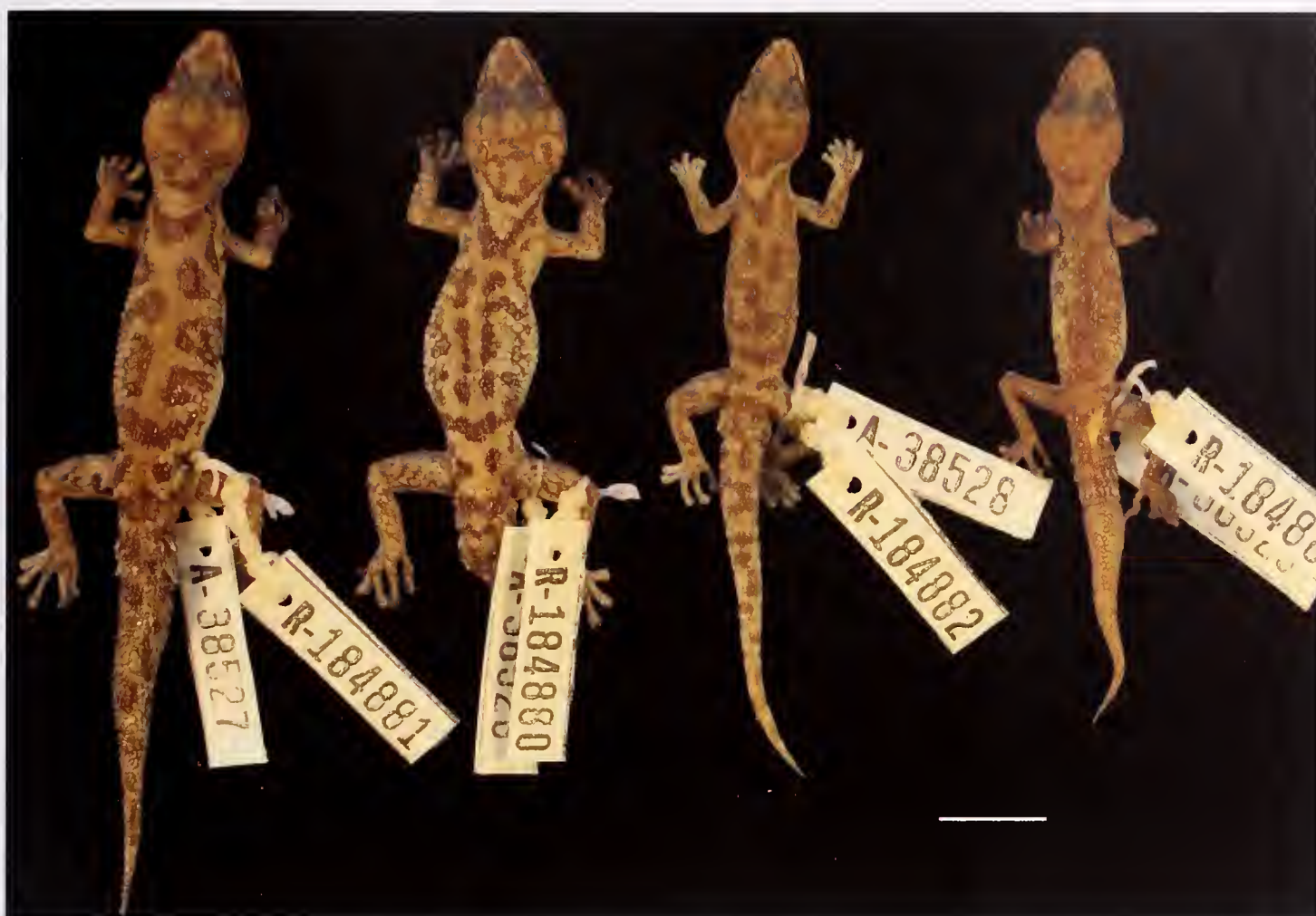
Fig. 5. Paratype series of Pachydactylus boehmei sp. n. showing variation in the dorsal color pattern and degree of pattern boldness. Scale bar = 10 mm.

scales of the tail base. In the male paratype, MCZ 184882, the infestation of mites around the tail base and scales of the precloacal spurs was particularly severe.