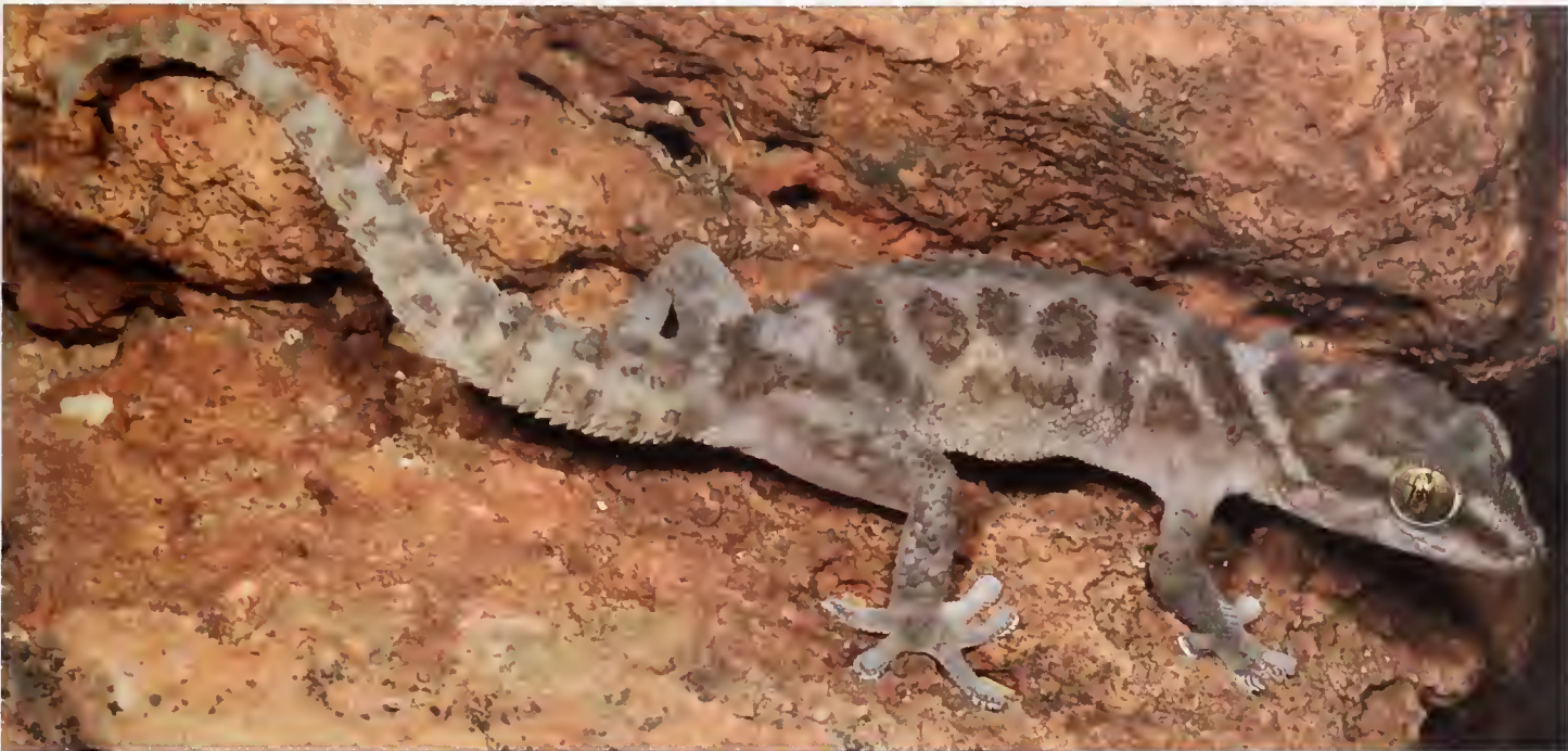
Fig. 3. Life photo of holotype of Pachydactylus boehmei sp. n.

ty on some digits of the pes; subdigital scansors, except for distalmost, entire, present only on distal portion of toes, approximately 1.5 times wider than more basal (non-scanorial) subdigital scales; interdigital webbing absent. Relative length of digits (manus): III > IV > II > V > I; (pes): IV > III > V > II > I. Subdigital scansors, exclusive of divided distalmost scansor (manus): I (4), II (4), III (4), IV (4), V (4); (pes) I (4), II (4), III (4), IV (4), V (4).