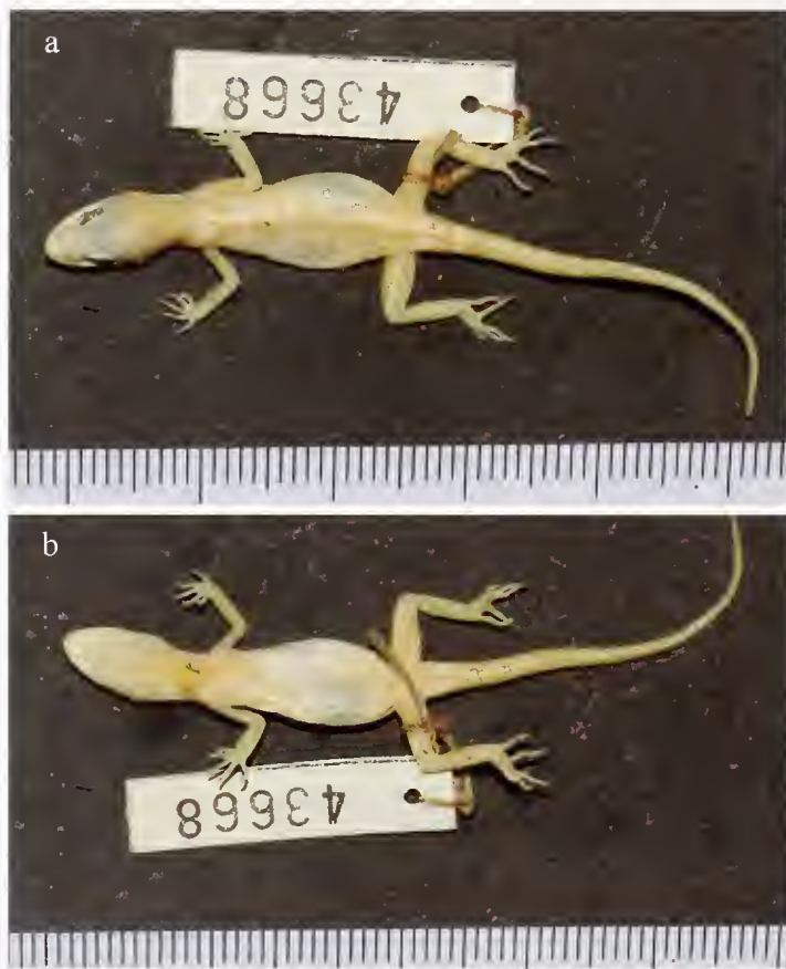
Fig. 1. Holotype of Tropicolotes wolfgangboehmei sp. n. from Ath-Thumamah, Saudi Arabia (Fig. 1a: dorsal view, Fig. 1b: ventral view, Scale: 1mm interline distance).

Despite the overall similarity of the taxa involved and the generally low level of character displacement, which is typical for geckocs, it became clear, that the specimens from central Saudi Arabia differ in several characters from all known taxa in the genus Tropicolotes and will therefore be described as a new species.