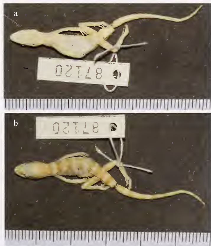
Fig. 3. Paratype of Tropicolotes wolfgangboehmei sp. n. from Ath-Thumamah, Saudi Arabia (Fig. 3a: dorsal view, Fig. 3b: ventral view, Scale: 1 mm interline distance).

Description of the Holotype. An adult female with intact tail. Body depressed. Snout-vent-length (SVL) 29.4 mm, Tail length 32.8 mm. Head narrow, 9.3 mm long (about 31.6 % of SVL). Neck distinct. Right limb 10.8 mm long. 5 th digit of left manus lacking claw, all other digits complete. Tail 1.12 times SVL, cylindrical tapering evenly to its tip.