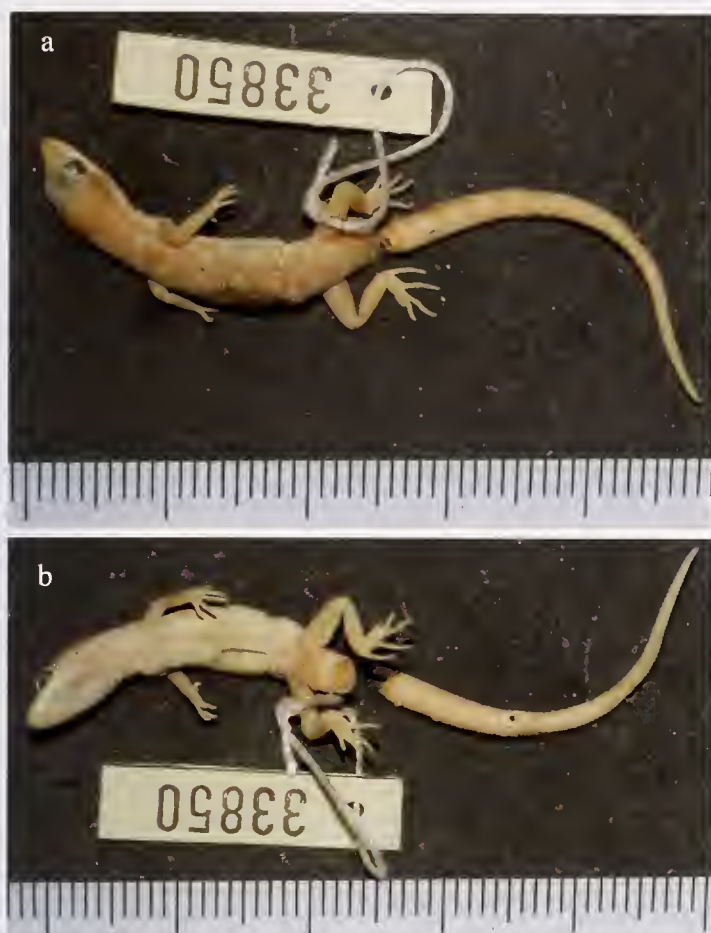
Fig. 6. Tropicolotes steudneri (ZFMK 33850), Wadi Halfa, Sudan. (Fig. 6a: dorsal view, Fig. 6b: ventral view, Scale: 1mm interline distance).

marked interruption between throat and chest and cloacal slit. Dorsal sides of forelimbs covered with imbricate scales, some of which show very slight carination, scales of ventral sides juxtaposed and slightly swollen, somewhat smaller than scales on dorsal side of forelimbs. Lamellar formula (digit 1 to 5) for left manus: 9, 11, 15, 13, 10.