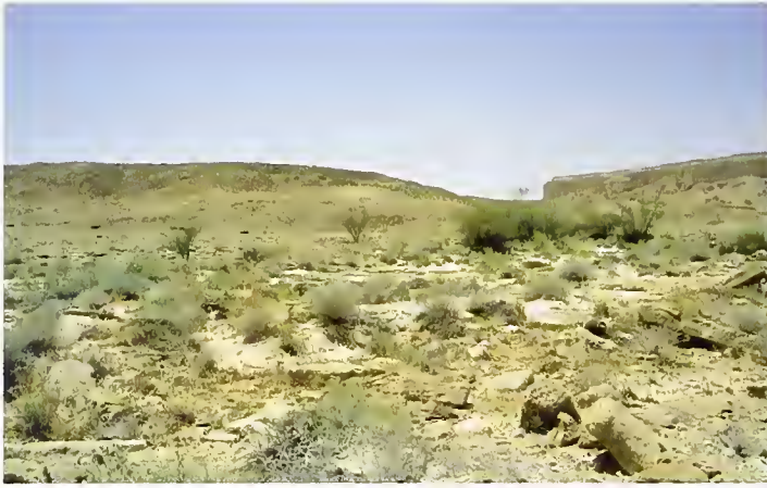
Fig. 4. Habitat and Paratype locality of Tropicolotes wolfgangboehmei sp. n. at Ath-Thumamah (25° 16' N, 46° 37' E), Saudi Arabia.

Rostral 1.5 times as wide as high, divided partly by a median cleft. Nostril bordered by rostral, first upper labial and two small postnasals, which are separated by two large internasals. The internasals are followed by one pair of subequal scales. Snout and upper surface of the head covered by hexagonal scales which are juxtaposed. Loreal region covered with slightly swollen scales, which are somewhat smaller than the remaining scales on the head. 16 interorbitals, 10/10 upper labials, 8/8 lower labials. Occipital region covered by juxtaposed scales slightly smaller than the interorbitals, which become increasingly swollen in the neck. Mental slightly wider than rostral, pentagonal in shape extending posteriorly not to the level of the suture between first and second lower labials. One pair of