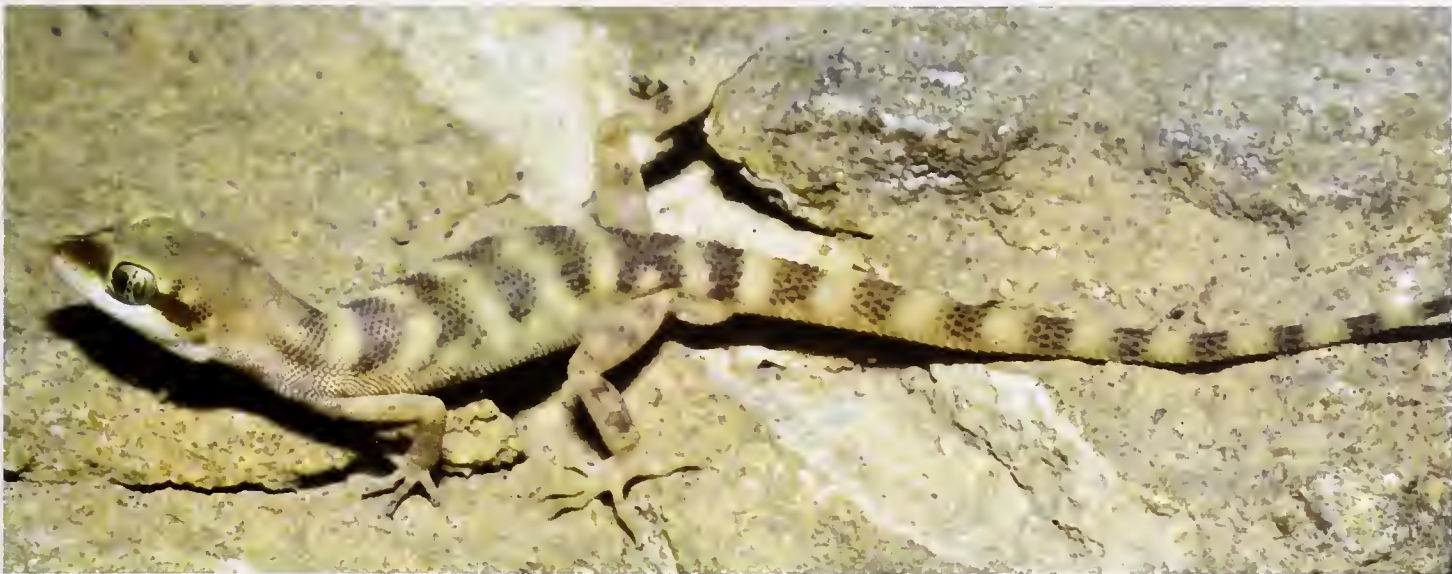
Fig. 2. Paratype of Tropicolotes wolfgangboehmei sp. n. from Ath-Thumamah (25° 16' N, 46° 37' E), Saudi Arabia in life.