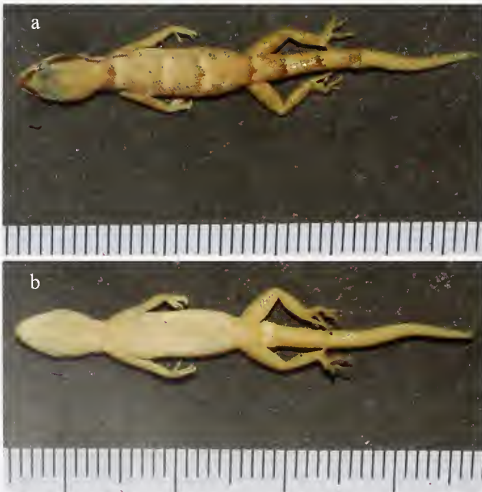
Fig. 5. Tropicolotes nattereri (SMF 47112), Wadi el Hedhira, Central Negev, Israel (Fig. 5a: dorsal view, Fig. 5b: ventral view, Scale: 1mm interline distance).

Rostral 1.5 times as wide as high, divided partly by a median cleft. Nostril bordered by rostral, first upper labial and two small postnasals, which are separated by two large internasals. The internasals are followed by one pair of subequal scales. Snout and upper surface of the head covered by hexagonal scales which are juxtaposed. Loreal region covered with slightly swollen scales, which are somewhat smaller than the remaining scales on the head. 16 interorbitals, 10/10 upper labials, 8/8 lower labials. Occipital region covered by juxtaposed scales slightly smaller than the interorbitals, which become increasingly swollen in the neck. Mental slightly wider than rostral, pentagonal in shape extending posteriorly not to the level of the suture between first and second lower labials. One pair of