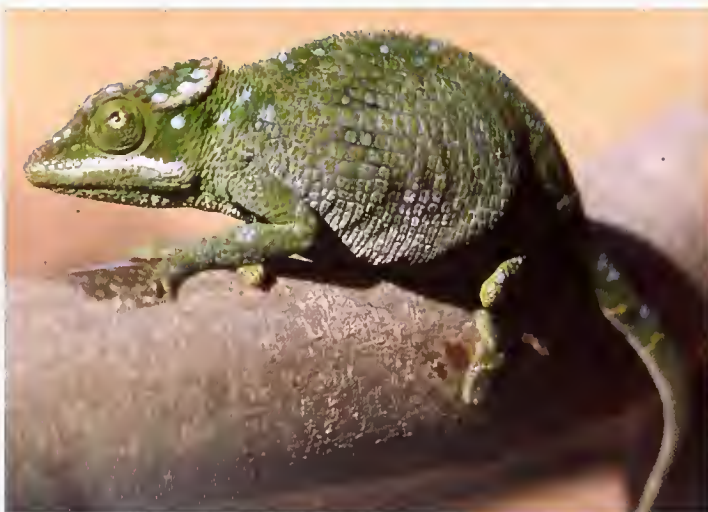
Fig. 7. Female paratype of K. u. arytitor ssp. n. in life.

species have been described from montane forests in Kenya and Tanzania (Menegon et al. 2009, Necas 2009, Necas et al. 2009) and several subspecies have also been raised to species status based on genetic divergence and detailed morphological studies (Mariaux et al. 2008). No doubt more species remain to be discovered in the still poorly surveyed mountain ranges across East Africa. The discovery of K. uthmoelleri in the South Pare Mountains also shows that species' distribution ranges are not well documented and it is quite likely that K. uthmoelleri also occurs on other massifs in-between these now known populations, such as Mt. Kilimanjaro and Mt. Meru (Fig. 8). K. uthmoelleri has a similar distribution to the Trioceros sternfeldi species complex, including the recently described T. hanangensis (Krause & Böhme 2010). Although the phylogeography of all T. sternfeldi populations has not been investigated, the Mt. Hanang population has been identified as a divergent sister clade to the Mt. Meru/ Kilimanjaro populations. A similar pattern is found in K. uthmoelleri , the Mt. Hanang populations morphologically di-