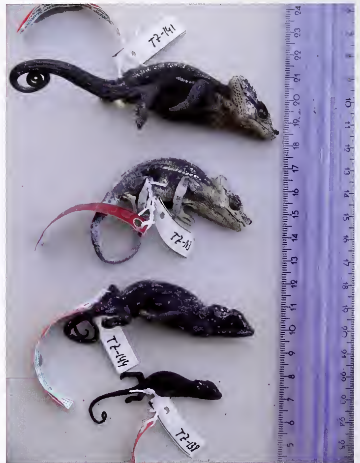
Fig. 2. Type material of K. u. arytator ssp. n..

All measurements and investigated morphological characters of the specimens are listed in Tables 1–3. The morphological traits which differentiate the male specimens of Mt. Hanang from those of the South Pare Mountains and Ngorongoro crater highlands are: higher measurements, a relatively broader and shorter head, rougher (more convex) scalation on the head and body, canthus parietalis (cp) not bi-forked anteriorly but fan-shaped anteriorly and the cp composed of two rows of scales (Fig.