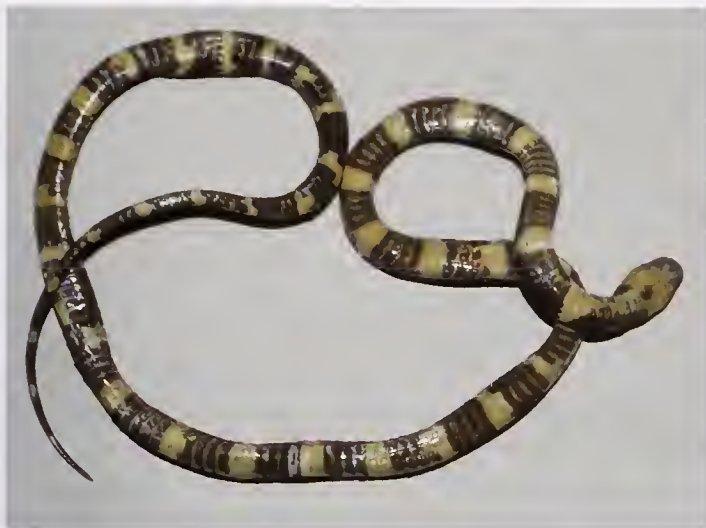
Fig. 2. Ventral view of preserved holotype of Lycodon synaptor sp. n., BMNH 1905.1.30.63 from Dongchuan, 100 km north of Kunming, Yunnan Province, People's Republic of China.