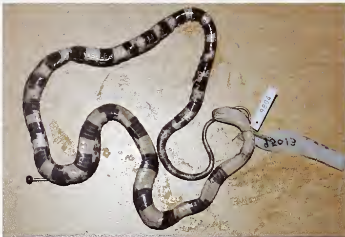
Fig. 5. Ventral view of Lycodon fasciatus . CIB 9804, from Ruili City, Yunnan. Note the whitish colouration of the anterior part and the speckling of the posterior part.

Dentition. A total of 10 maxillary teeth, with the following formula: 4 small anterior teeth + 2 strongly enlarged teeth + a wide gap + 2 small teeth + a small gap + 2 strongly enlarged, posterior teeth.