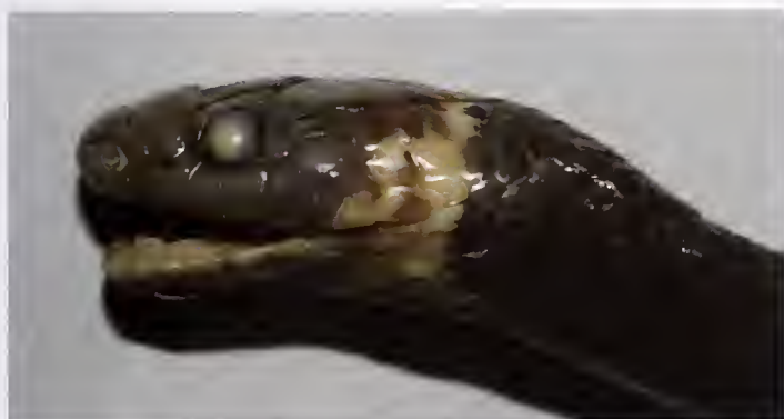
Fig. 3. Lateral view of the right side of the head of preserved holotype of Lycodon synaptor sp. n., BMNH 1905.1.30.63 from Dongchuan, 100 km north of Kunming, Yunnan Province, People's Republic of China.

Diagnosis. A species of the genus Lycodon characterized by: (1) loreal scale not entering orbit; (2) 15–17 dorsal scale rows at the forepart of the body and 17 dorsal scale rows at midbody; (3) upper and vertebral dorsal rows (6–7) keeled; (4) 201–203 ventrals in females, males unknown; (5) 68–69 Sc in females, males unknown; (6) a relative tail length of about 0.189–0.192 in females, males unknown; (7) 8 supralabials with SL 4–6 touching the orbit (7) 30–31 narrow white bands on a dark body; (8) width of the first band vertebral 0.5–1.0 scales, on the base 3 ventrals; and (9) the belly with discrete bands throughout.