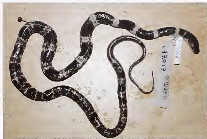
Fig. 4. Dorsal view of Lycodon fasciatus . CIB 9804, from Ruili City, Yunnan. Note the irregular bands.

Detailed comparisons with other species of the genus Lycodon appear below in the Discussion.