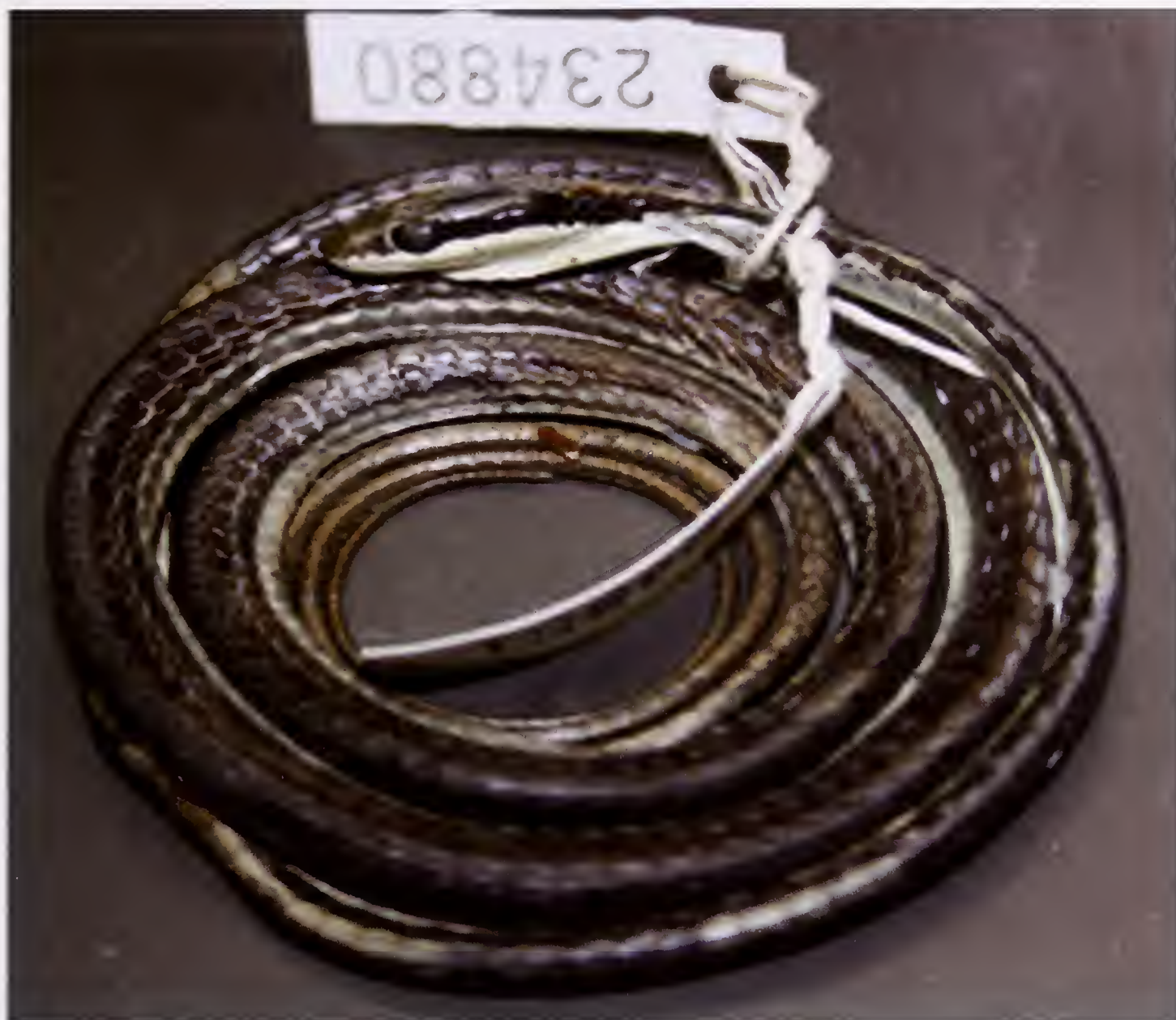
Fig. 2. Dendrelaphis walli sp. n., holotype (CAS 234880).