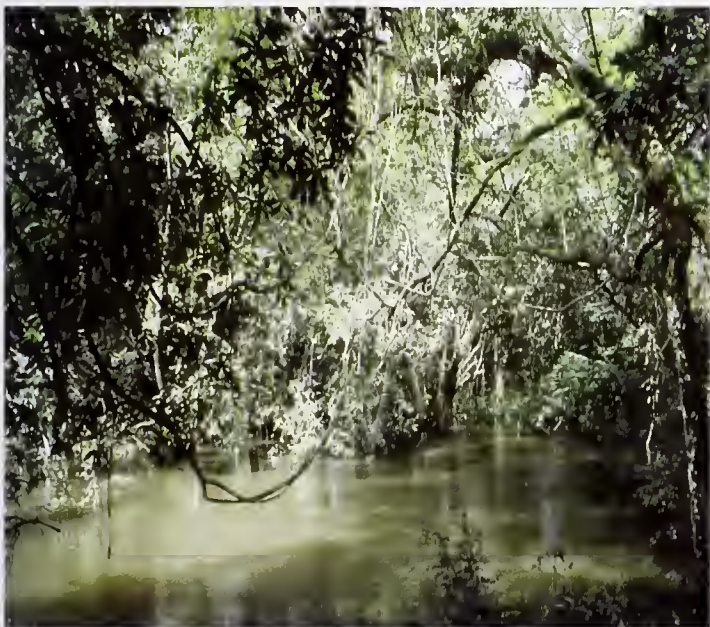
Fig. 4. Inundated lowland forest at Malweta village, Ziama Forest.

for completeness’ sake: Agama agama (ZFMK 64473–479), Chamaeleo gracilis (ZFMK 64489), Varamus exanthematicus (ZFMK 64471: head only), V. niloticus (ZFMK 66470), Crotaphopeltis hotamboeia (ZFMK 64467–468), Grayia smithii (ZFMK 64465–466), Philothamnus irregularis (ZFMK 64469), Psammophis el-