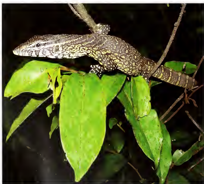
Fig. 30. Varanus uiloticus , juvenile specimen from the Fouta Djallon range, W Guinea.

– Lamprophis virgatus – Chabanaud (1921): N'Zébéla, N'Zérékoré (as Boodon virgatus ); Villiers (1950), Angel et al. (1954 b): Mt. Nimba (as Boaedon virgatus ); Condamin (1959): Sérédou; Böhme (2000): Ziama Forest; Ineich (2003): Mt. Nimba; this paper.