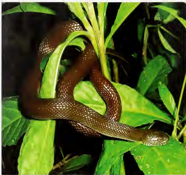
Fig. 18. Afronatrix anoscopus , unicoloured specimen from Mt. Nimba.