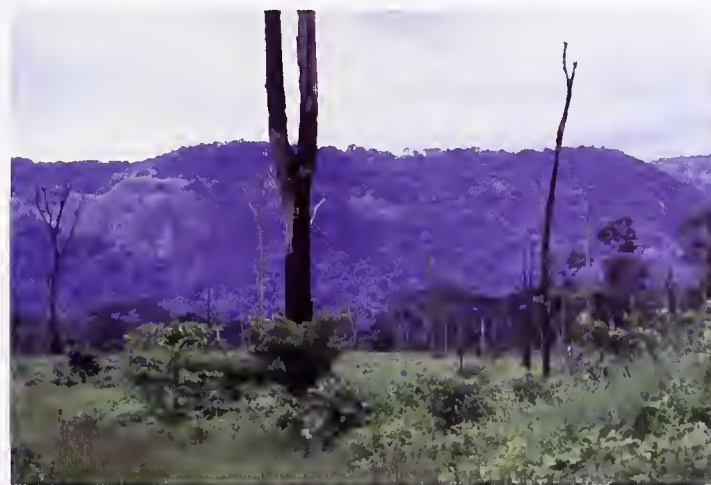
Fig. 5. Ziama Forest near Sérédou: reforestation of fire-degraded foreground with Terminalia sp., slopes in the background still with primary forest.

Further Guinean sites were surveyed with a main emphasis on amphibians. From 27 November to 6 December 2002, in autumn 2004 and in September 2008 we surveyed the Simandou Mountain Range, which extends for 100 km from Komodou in the north to Kouankan in the south. The altitudinal range is about 600 m with the Pic de Fon at the southern part being the highest peak (1,656 m a.s.l.: Fig. 7). Approximately 25,600 ha of this forest were protec-