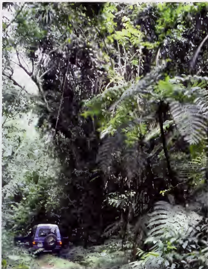
Fig. 3. “Antenna hill” at Sérédou, submontane forest with the tree fern Cyathea manniana.

for completeness’ sake: Agama agama (ZFMK 64473–479), Chamaeleo gracilis (ZFMK 64489), Varamus exanthematicus (ZFMK 64471: head only), V. niloticus (ZFMK 66470), Crotaphopeltis hotamboeia (ZFMK 64467–468), Grayia smithii (ZFMK 64465–466), Philothamnus irregularis (ZFMK 64469), Psammophis el-