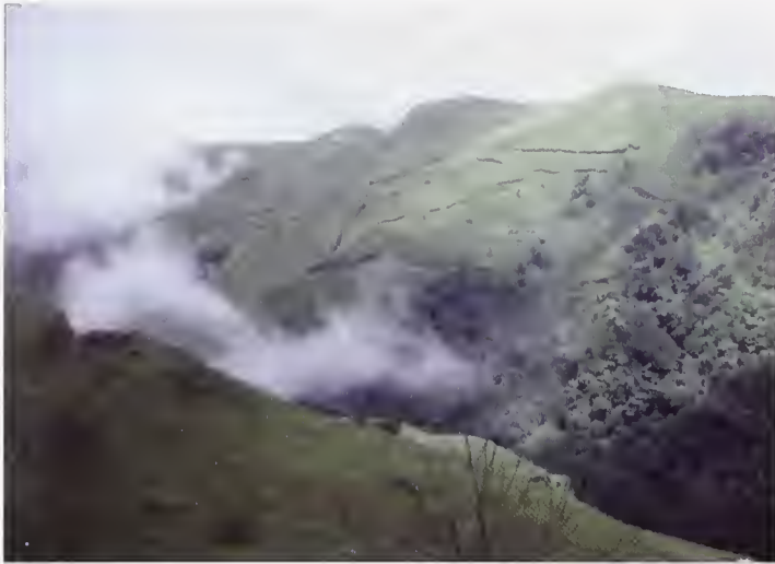
Fig. 6. Mt. Nimba, at 1750 m (Photo: W. Böhme).

ted in 1953, but larger parts are currently explored for iron ore. The Simandou range is in the transition between the forest and savanna zones, offering a wide range of different habitat types. Especially the rain and montane gallery and ravine forest on the western slopes range far more North than anywhere else in West Africa (for more details see Rödel & Bangoura 2004a, b and literature cited therein). Three other forest sites were surveyed in November/December 2003: The Diéeké Classified Forest, situated about 25 km south of N'Zérékoré, comprises an area of 59,143 ha, with a mean altitude of 400–500 m a.s.l. The reserve comprises (almost) primary as well as secondary and highly degraded rainforest (for more details see Rödel et al. 2004). Currently it is under mining prospecting activities. The Mont Béro Classified Forest (26,850 ha) is situated at the northern limit of the rainforest zone, 56 km north of N'Zérékoré, 52 km south of Beyla and 40 km west of Lola. Its highest elevation is 1,210 m a.s.l. The dominant habitat types are semi-evergreen forest (Fig. 8) and savanna (Rödel et al. 2004). The Déré Classified Forest is situated at the eastern base of Monts Nimba and di-