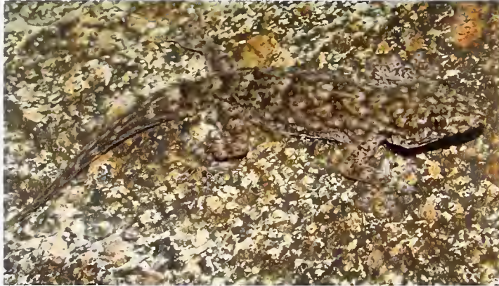
Fig. 26. Tarentola parvicarinata from Fouta Djallon Mts., W Guinea (Photo: C. Brede).

– Hemidactylus fasciatus – Rödel & Bangoura (2006): Diécké Forest; this paper; Mt. Nimba, photo record, C. Brede.