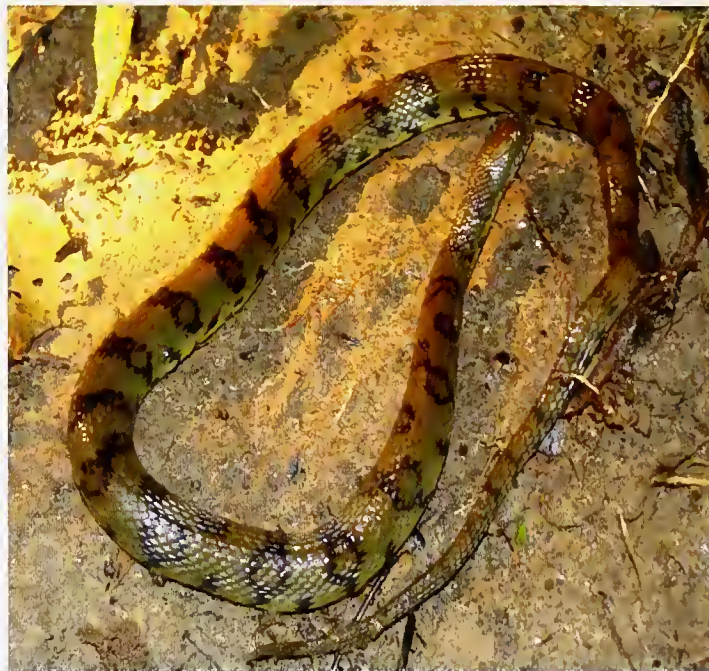
Fig. 19. Afronatrix anoscopus , patterned specimen from Pic de Fon.

Guinea exceeds that of our series in most of the data taken. A modern revision including also the central African populations seems highly desirable.