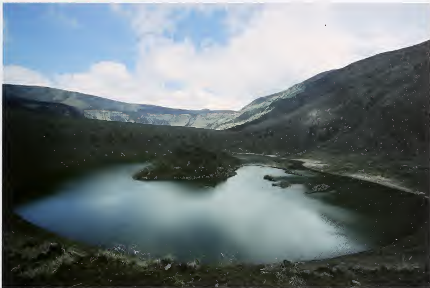
Figs 2. Cone Lake from within the tuff cone. The degree of visibility of the cone-shaped islet in the center can be used to estimate the lake's water level. View is in western direction.

earlier study, although this appears to be the case. Nevertheless, as data on the odonate fauna of the archipelago are very scarce, especially regarding their potential presence in the various water bodies, our report contributes to the documentation of both the islands' and this species' natural history.