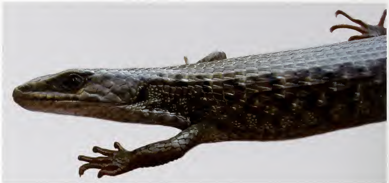
Fig. 1. The specimen of Elgaria coerulea principis (alive, not collected) encountered in Revelstoke (British Columbia, Canada) on September 25, 2009.