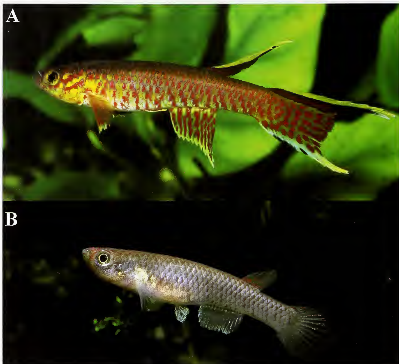
Fig. 2. A) Male of Aphyosemion pseudoelegans , collected at Boende in May 2002, not preserved. Digital copy of a colour slide. B) Female of Aphyosemion pseudoelegans , collected at Boende in May 2002, not preserved. Photographed by H. Ott three months after collection.

Holotype. MRAC 178016, male, 33.3 mm SL, Democratic Republic of Congo, Équateur Province, Tshuapa Basin, Boende, 0°14'S, 20°50'E, coll. P. Brichard, 1969.