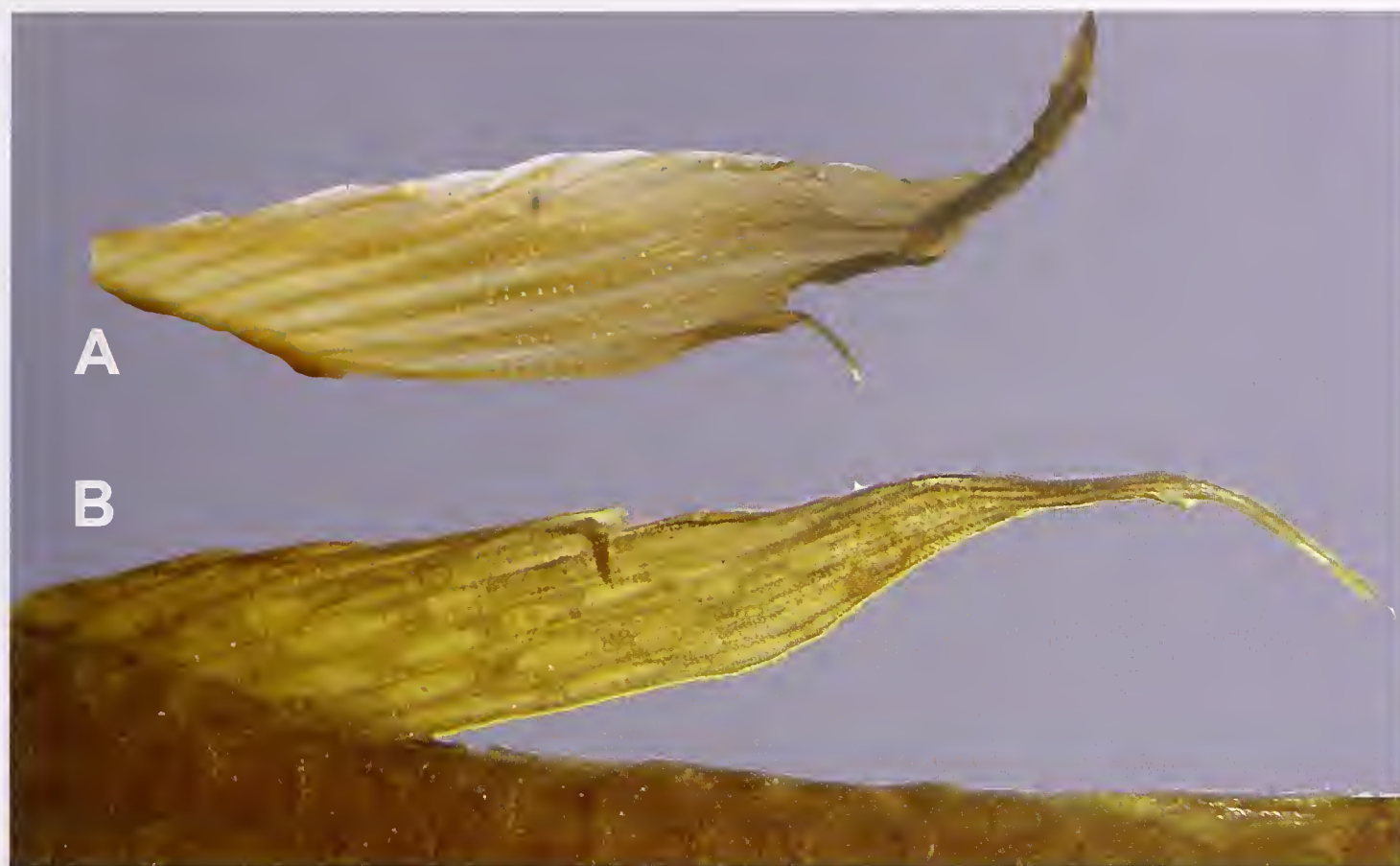
Fig. 3. Dorsal fin of male specimens preserved in ethanol. In these specimens the red pigmentation is lost, but the difference in colour pattern between the two species is still visible. A) A. pseudoelegans , MRAC 80709–80777, Bokuma, with plain greyish to brownish fin tissue. B) A. elegans , MRAC 93724, Bokuma, fin tissue with light dots which are the remains of the former red pigmentation.

Aphyosemion congicum has only a few red dots on the flanks and an almost dotless anal fin versus many red dots or bars on flanks, anal fin with many red dots or inter radial red stripes.