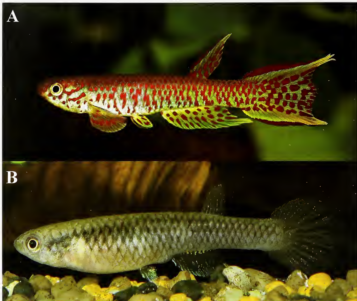
Fig. 4. A) Male of Aphyosemion elegans , commercial import (2006) from the Tshuapa River near Boende, not preserved. B) Female Aphyosemion elegans , commercial import (2006) from the Tshuapa River near Boende, not preserved.

tudinal series 28–30, with two scales posterior to hypural plate; seven transversal scales, 12 scales around caudal peduncle.