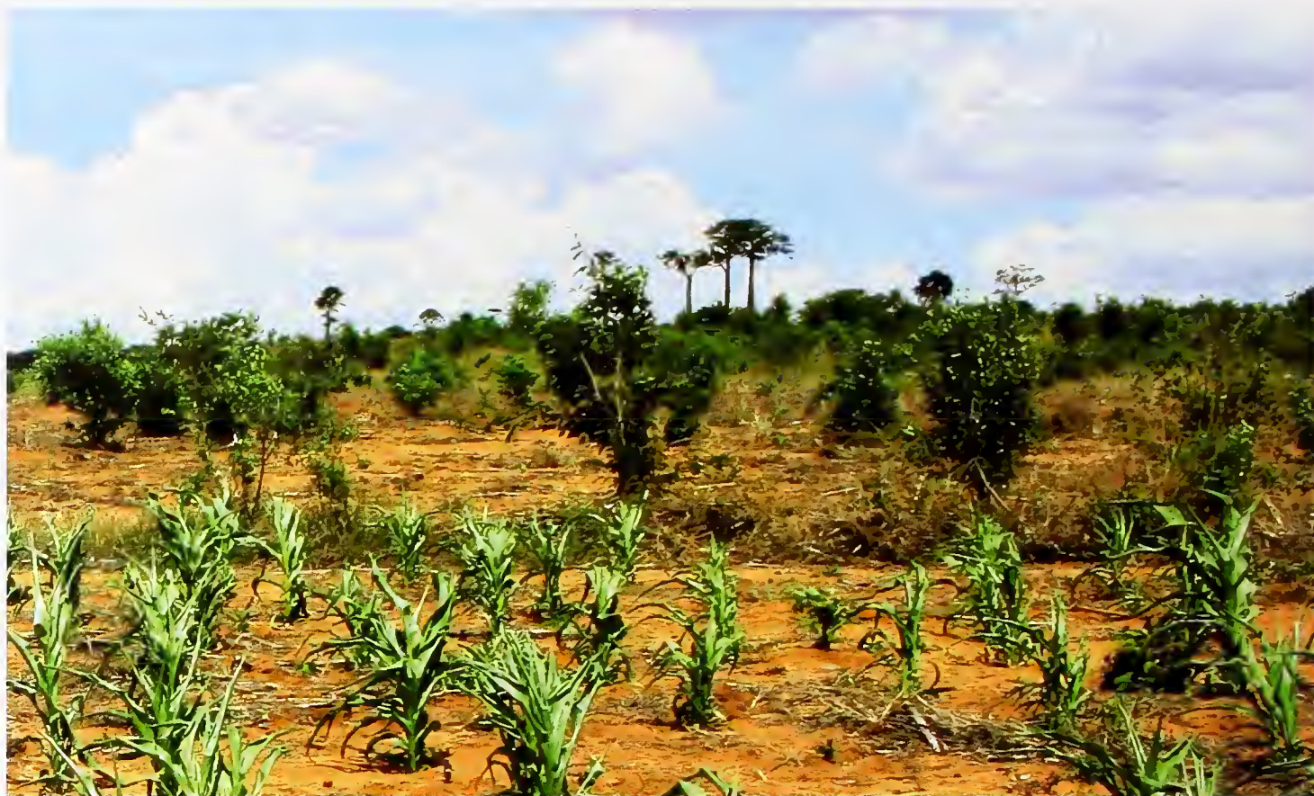
Fig. 1. Habitat of Voeltzkowia rubrocaudata : corn plantation (in foreground) near the village of Andranomaitso, Commune rurale de Sakaraha.