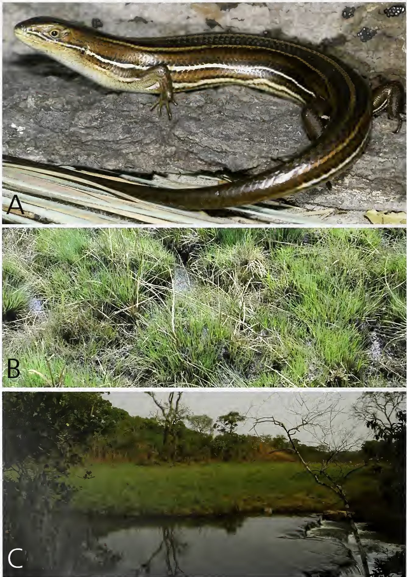
Fig. 3. Trachylepis ivensii . A = Specimen from Nchila Reserve, Hillwood Farm, Ikelenge, Zambia. B = Typical habitat of T. ivensii in the Nchila Reserve. C = Typical habitat of T. ivensii at the Zambezi north of Ikelenge.