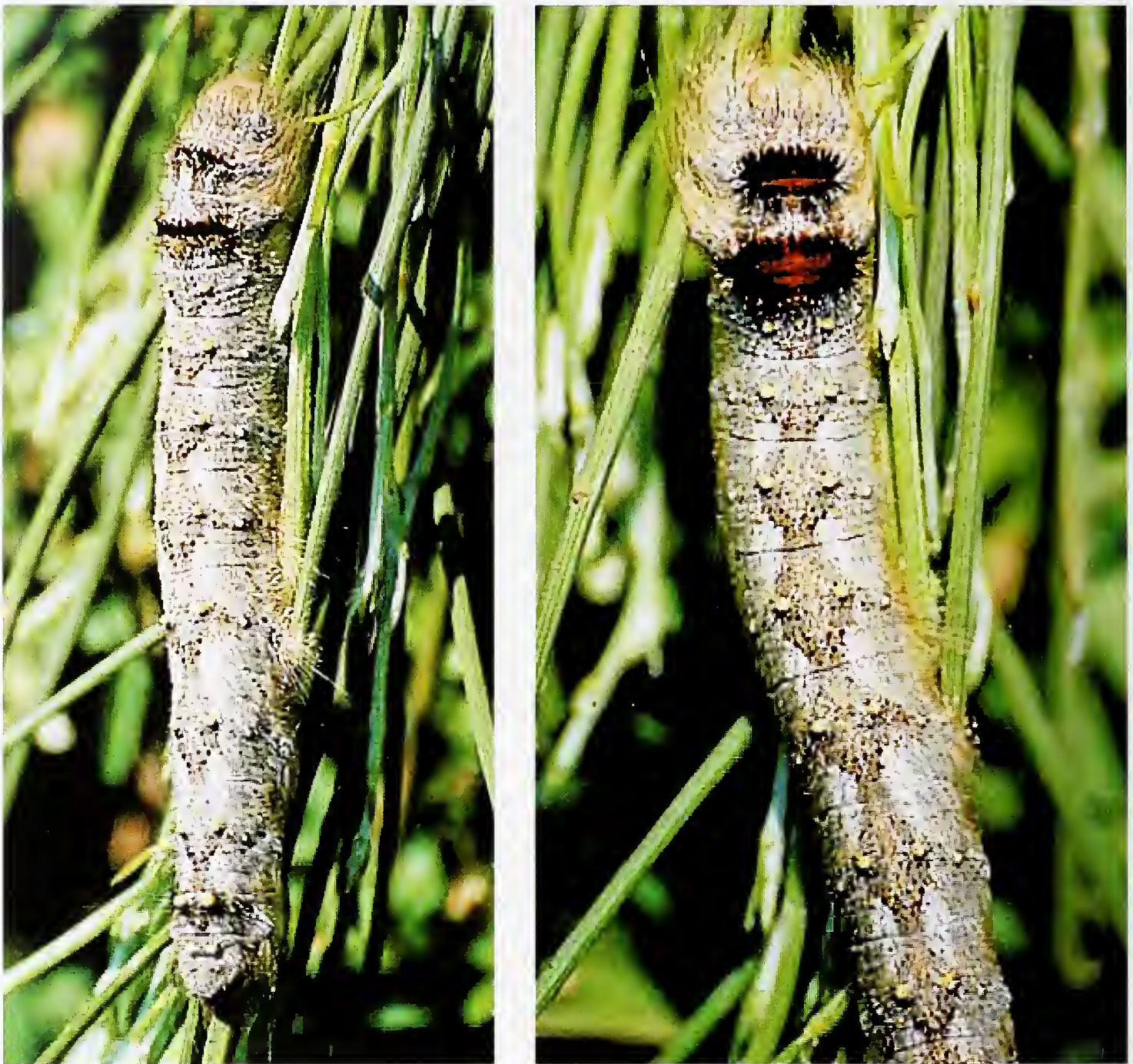
Fig. 1. Larva of Streblote panda , last instar. Left: at rest, right: disturbed, showing the two urticating crevices.

ated longitudinally from the base onwards over 14/15^{\text{th}} of its length (Fig. 7). The distal part ( 1/15^{\text{th}} ) comprises an area with annular ligaments (Figs. 7, 8), tapering to the pointed and perforated tip (Figs. 9, 10). The estimated number of pores per hair is about 400; their diameter reaches 0.3 \mu\text{m} . The hairs are inserted in raised cupolae, from which they may be detached (Fig. 11).