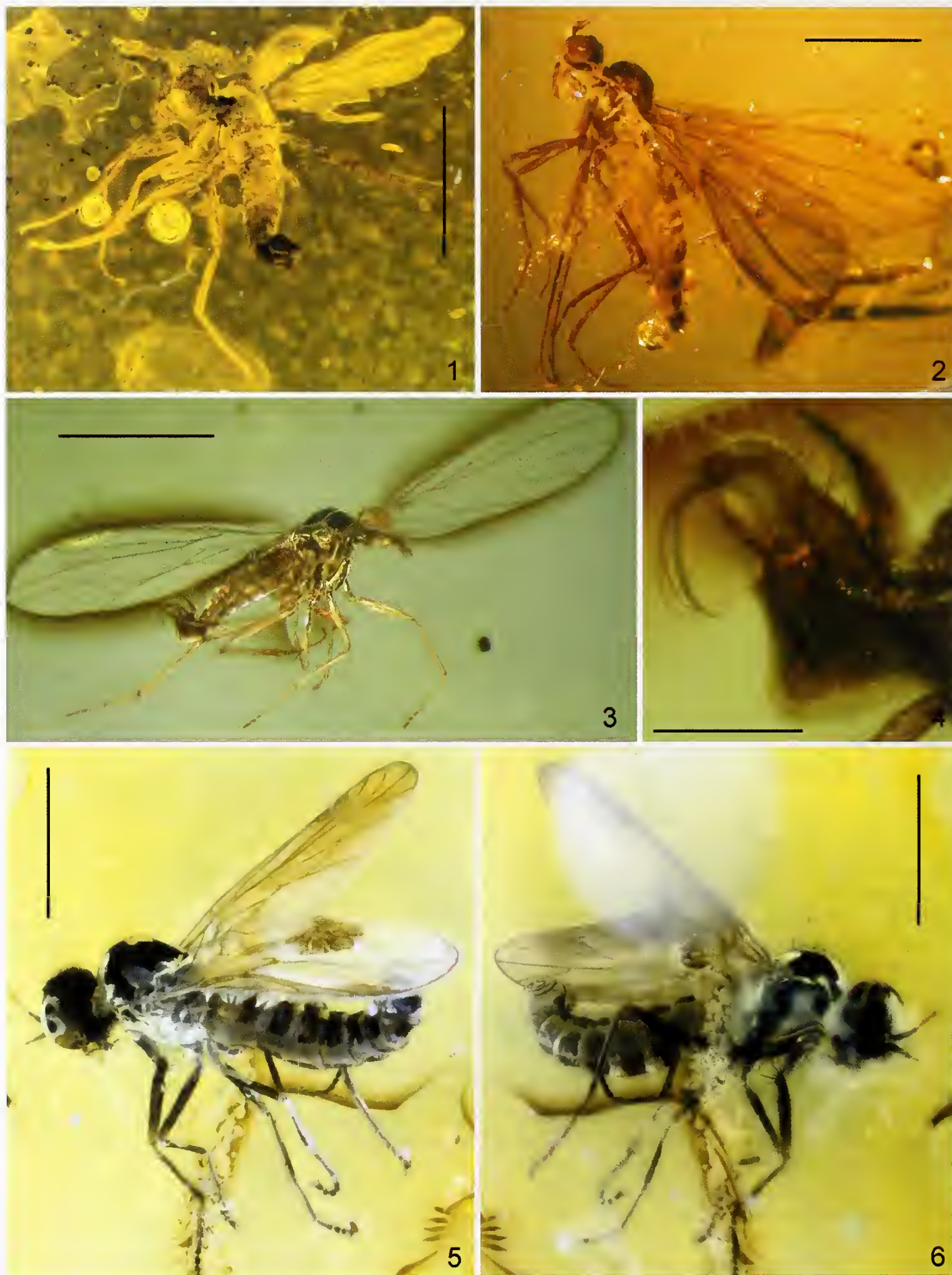
Figs 1–6. Habitus and male terminalia photographs of Baltic amber species of Ragas . 1. R. electrica , male. 2. R. succinea , female. 3. R. eocenica , male. 4. R. eocenica , male terminalia. 5. R. ulrichi , male, right side. 6. R. ulrichi , male, left side. Scale bar = 1.0 mm, except Fig. 4 where scale bar = 0.25 mm.