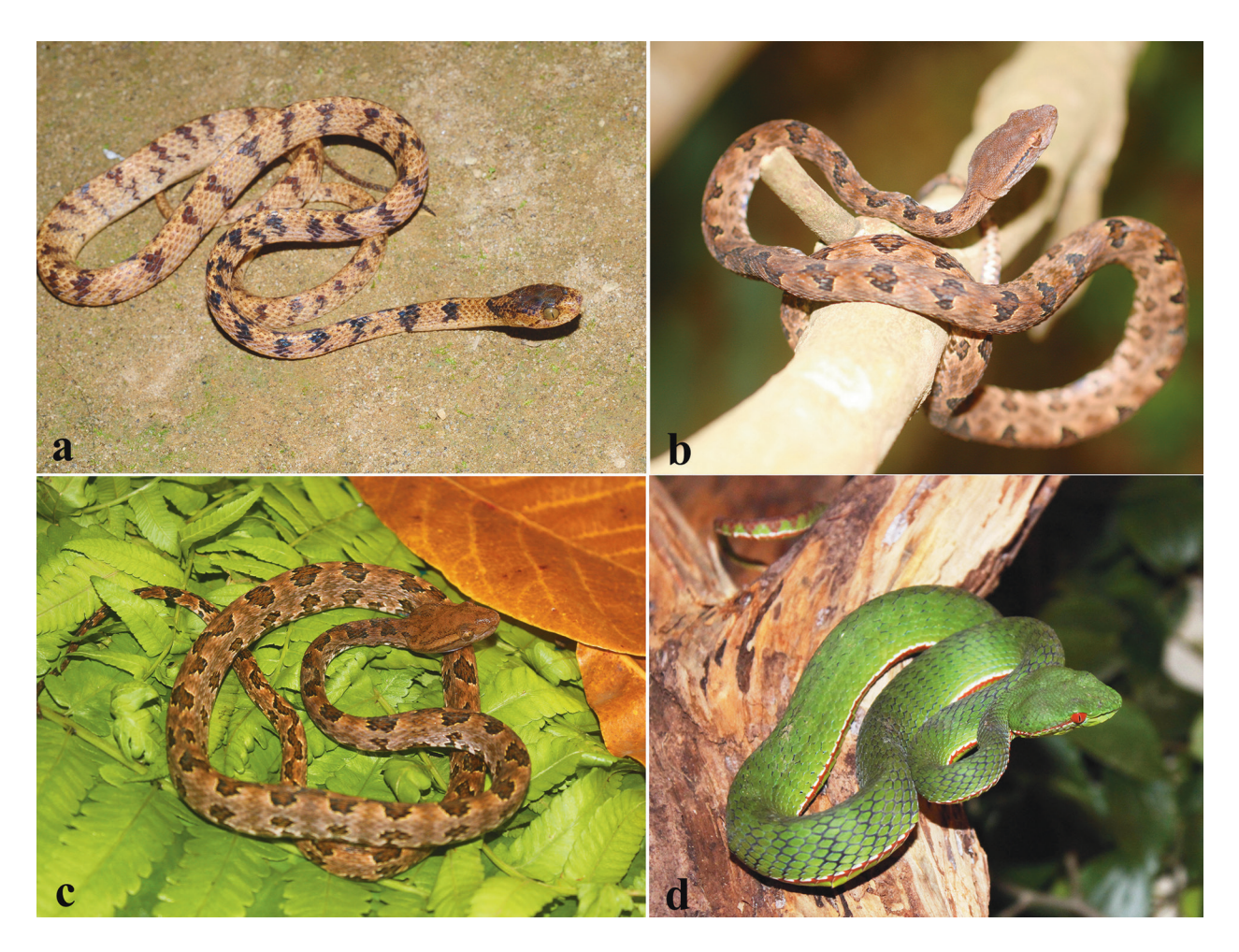
Fig. 3. a) Pareas hamptoni (IEBR 4227), b) Protobothrops mucrosquamatus (male) (IEBR 4230) and c) female (IEBR 4231), and d) Trimeresurus gumprechti (IEBR 3918) from Hoa Binh Province, Vietnam..

nasal, third large, in contact with subocular, fourth and fifth separated from subocular by a small scale; temporals small; infralabials 13/12, the first pair in contact with each other, the first three pairs in contact with the chin shields; dorsal scale rows 23–21–15, rhomboid, strongly keeled throughout but smooth on the outermost row; ventrals 160 (+4 preventrals); cloacal undivided; subcaudals 70, divided.