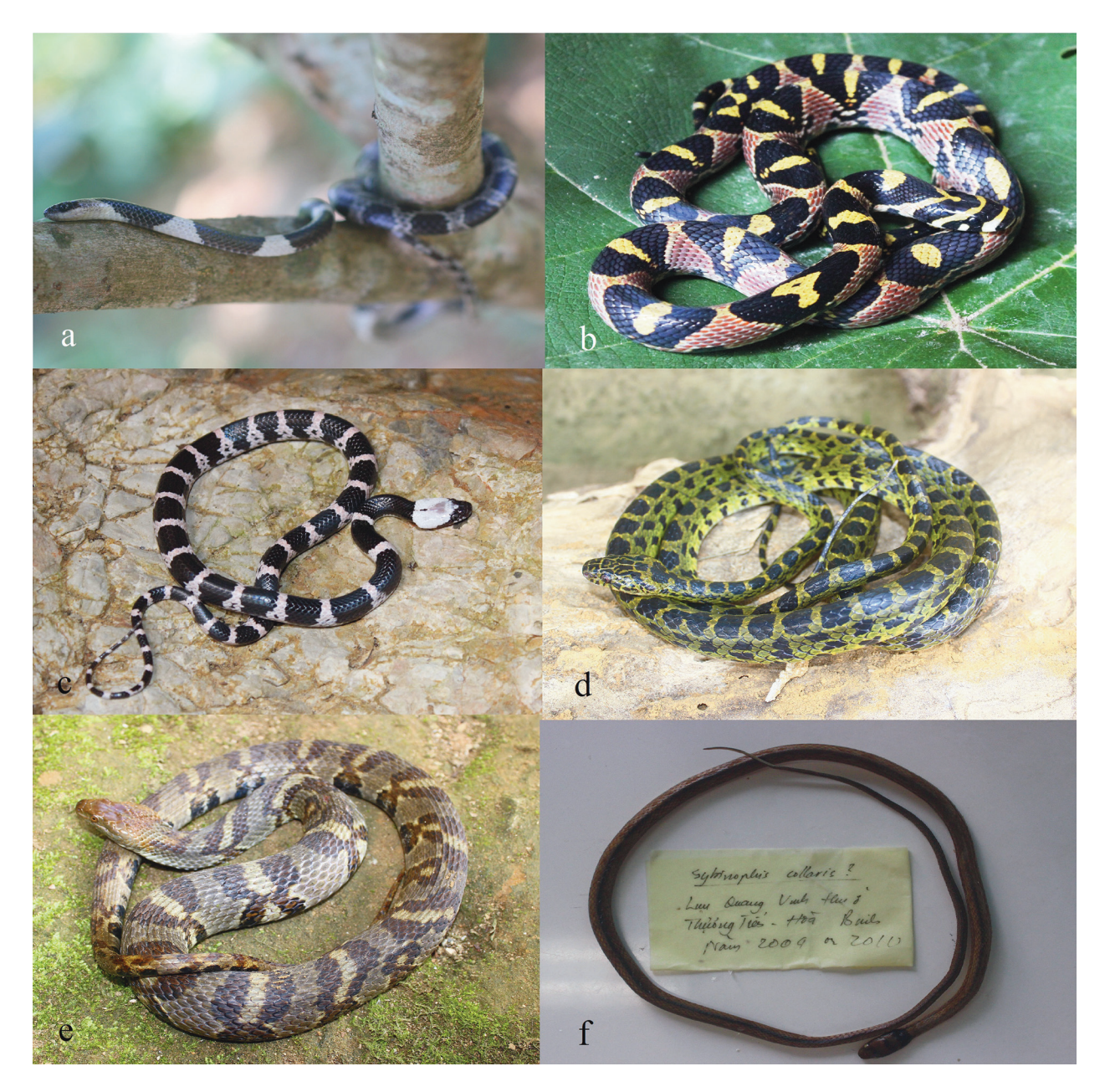
Fig. 2. a) Dryocalamus davisonii (IEBR 4058), b) Euprepiophis mandarinus, c) Lycodon futsingensis (IEBR 4171), d) Lycodon meridionalis (IEBR 4151), e) Sinonatrix aequifasciata (IEBR 4226), and f) Sibynophis collaris (IEBR 4224) from Hoa Binh Province, Vietnam.