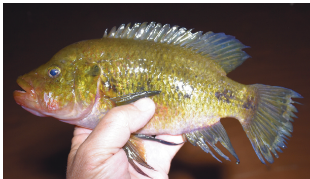
Fig. 3. Hemichromis fasciatus from Lake Boukou in life.

Description. Two lateral lines. Scales cycloid. No pharyngeal hanging pad between gills. Outer jaw teeth