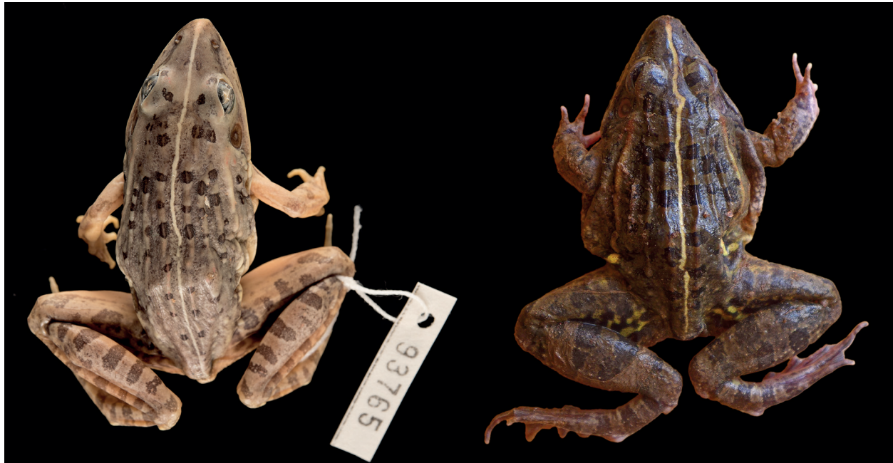
Fig. 5. Ptychadena trinodis from between Douentza and Boni, Mali. Left: ZFMK voucher; right: specimen not collected.