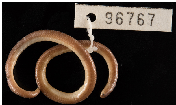
Fig. 10. Leptotyphlops albiventer from Dérégoué, Burkina Faso.

length as well as to its body diameter, the midbody scale count, the number of subcaudals and the color pattern of a brownish dorsal and a whitish ventral side fit the characteristics of this species as described by Hallermann & Rödel (1995) and Trape & Mané (2006). ZFMK 97767 (Fig. 10) documents thus the fourth record from a fourth country, but the first for Burkina Faso.