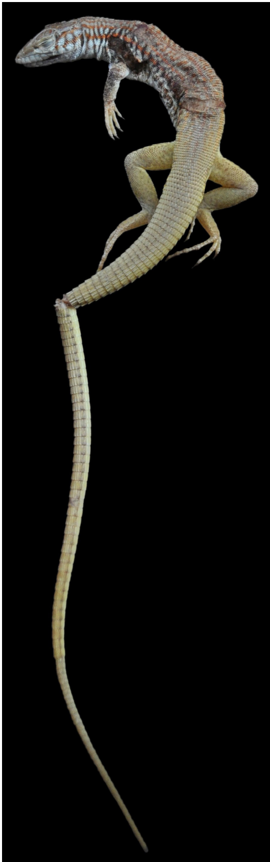
Fig. 13. Latastia longicaudata from Douentza, Mali.