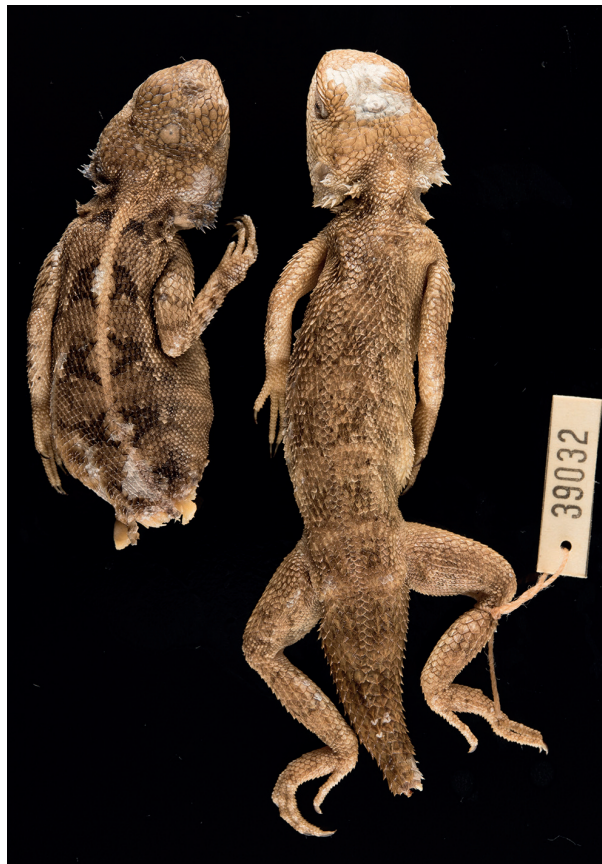
Fig. 8. Agama sankaranica from NE of Dérégoué (left) and from Ouagadougou (right), Burkina Faso. Note the absence of a light vertebral line in the right specimen.