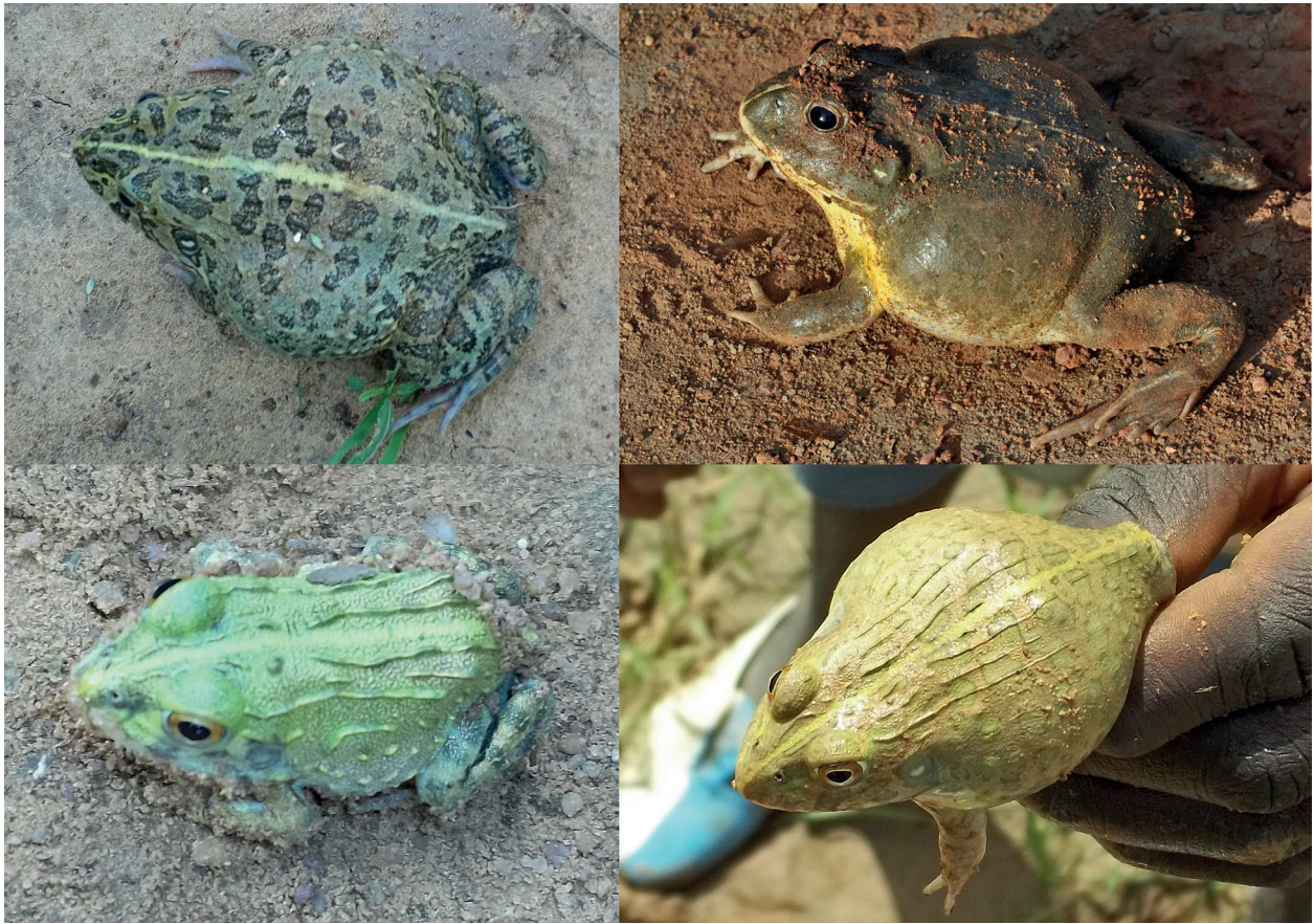
Fig. 7. Four specimens of Pyxicephalus sp. from between Mopti and Sévaré, Mali, to show the variability in color pattern. The specimen on lower left is a juvenile (not on scale).