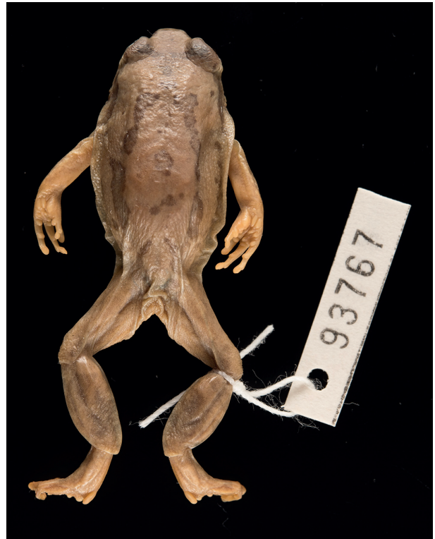
Fig. 4. Leptopelis bufonides from between Douentza and Boni, Mali.

A comment to be made on this widely distributed and common species refers to the generic nomenclature. After the partition of the collective genus Bufo , the Afrotropi-