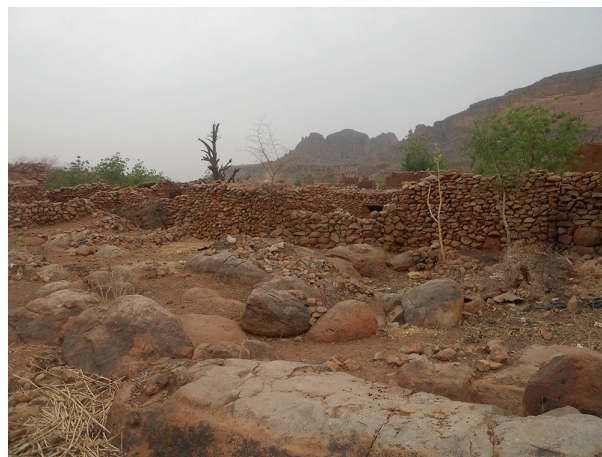
Fig. 3. Pergué village, Mali.

The area between Douentza and Bandiagara was visited several times, in 2009 (September), 2010 (July) and in 2011/2012, in the course of Dogon linguistic studies carried out by Jeffrey Heath in the Dogon Province. Some amphibians and reptiles were seen, photographed and – by focal sampling – collected. These voucher specimens are deposited in ZFMK's herpetological collection, as are the photographs in ZFMK's herpetological photo archive.