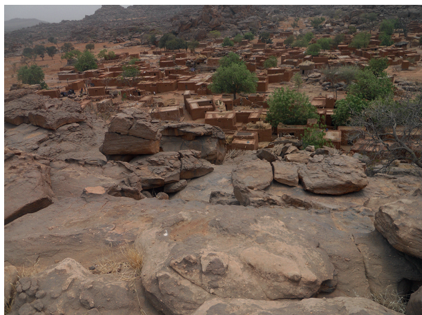
Fig. 2. Anda village, Mali.