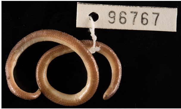
Fig. 10. Leptotyphlops albiventer from Dérégoué, Burkina Faso.

length as well as to its body diameter, the midbody scale count, the number of subcaudals and the color pattern of a brownish dorsal and a whitish ventral side fit the characteristics of this species as described by Hallermann & Rödel (1995) and Trape & Mané (2006). ZFMK 97767 (Fig. 10) documents thus the fourth record from a fourth country, but the first for Burkina Faso.