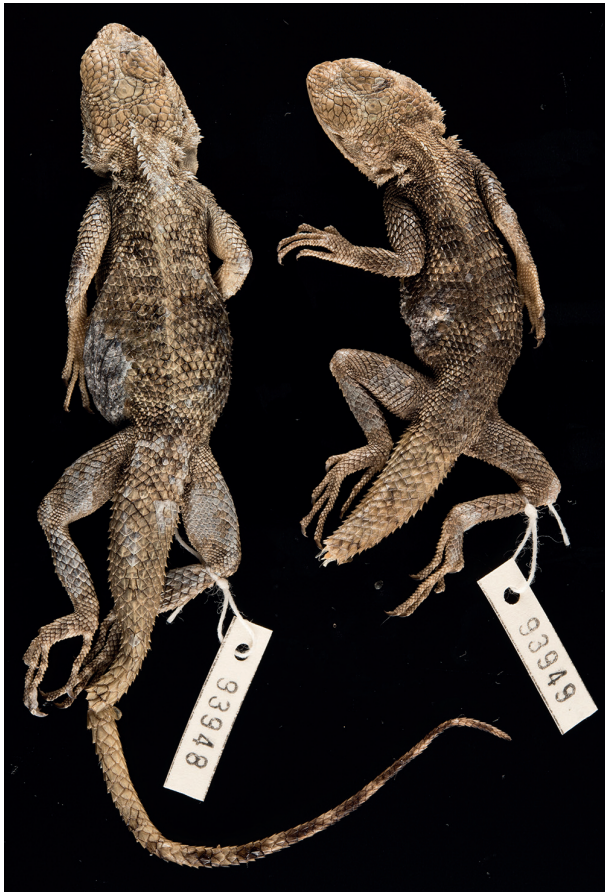
Fig. 9. Agama sp. from Dérégoué, Burkina Faso. Left: male, and right: female.

southeast. Recorded also for the Burkina Faso part of the RBTW in the east of the country (Chirio 2009).