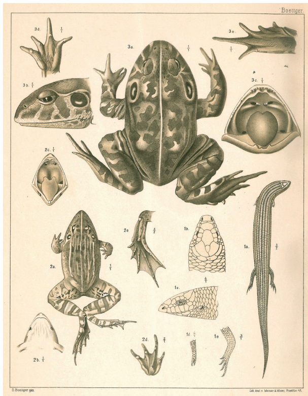
Fig. 6. Plate from Boettger (1881) showing the (presumably lost) type specimens of his Rana (currently Ptychadena ) trinodis (lower left) and Maltzania (currently Pyxicephalus ) bufonia (upper).