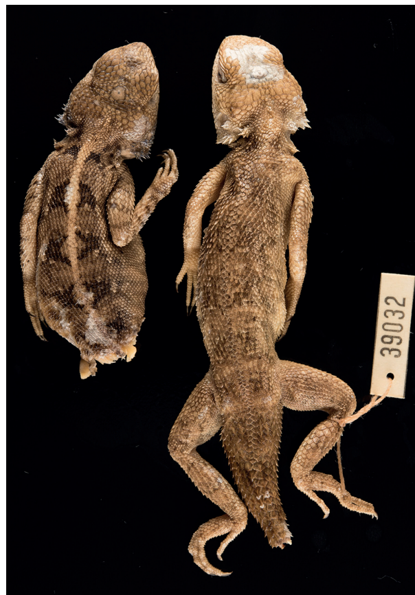
Fig. 8. Agama sankaranica from NE of Dérégoué (left) and from Ouagadougou (right), Burkina Faso. Note the absence of a light vertebral line in the right specimen.