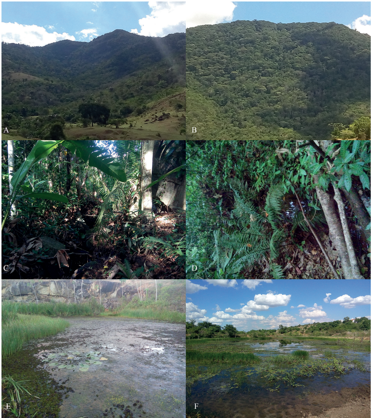
Fig. 2. Study areas in the southwestern region of Bahia. Fugiama farm in the Serra do Mandim (A, C and E). A: Semi-deciduous forest fragment; C: stream; E: permanent pond. Serra Azul farm in the Serra Azul (B, D and F). B: Semi-deciduous forest fragment; D: stream; F: permanent pond.

and emphasized the importance of more research aimed at other still under sampled groups, as, for example, reptiles. Therefore, the objective of our study was to inventory squamate reptile species from the Serra Azul and