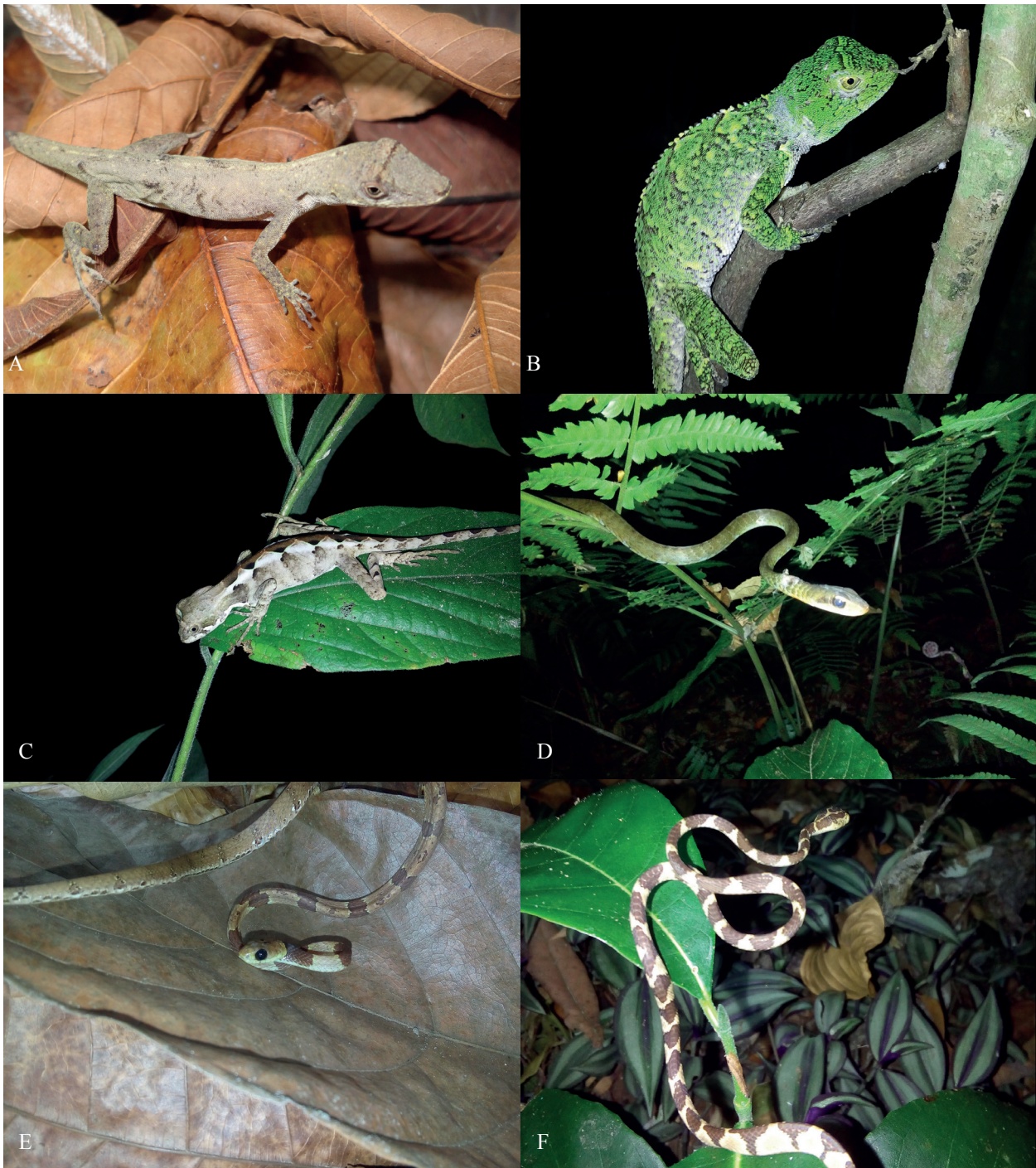
Fig. 3. Squamata recorded at Serra do Mandim and Serra Azul in southwestern Bahia, Brazil. A. Norops fuscoauratus ; B. Enyalius catenatus (male); C. E. catenatus (juvenile); D. Chironius fuscus ; E. Dipsas sazimai ; F. Imantodes cenchoa .

The rarefaction curve did not reach the asymptote and remained in ascending function (Fig. 5), even though 69% to 86% of the species indicated by the richness estimators (Chao 2 = 32.1 \pm 4.3 ; Jackknife 1 = 36.2 \pm 4.2 . Jackknife 2 = 39.2 and Bootstrap = 31.4) were sampled. However, the use of additional sampling methods as pit-